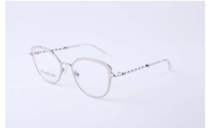
OP592 Julie Silver