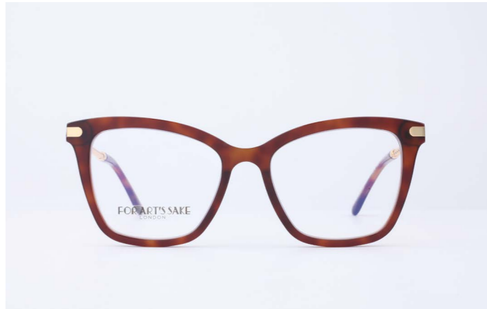
OP582 Paris Two Brown