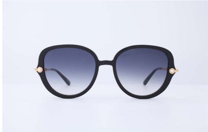
SJ1 Primrose Black / Black gradient lens