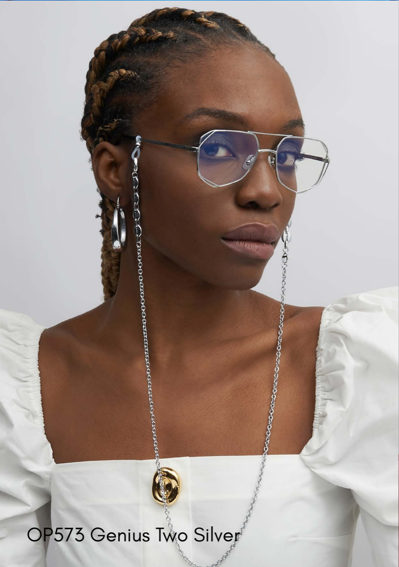
OP573 Genius Two Silver