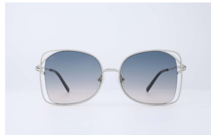
SA3 Carousel Topaz / Topaz gradient lens