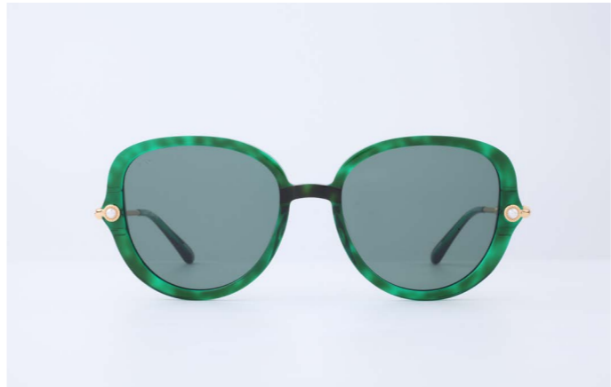
SJ3 Primrose Green / Green tinted lens