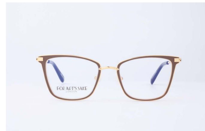
OP622 Windsor Brown