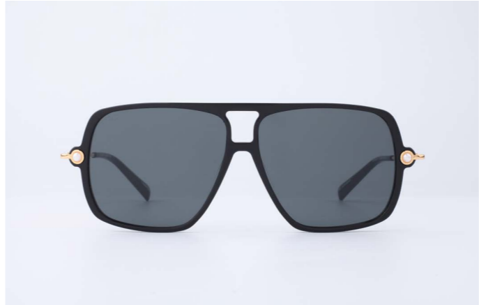
SH1 Cinnamon Black / Black tinted lens