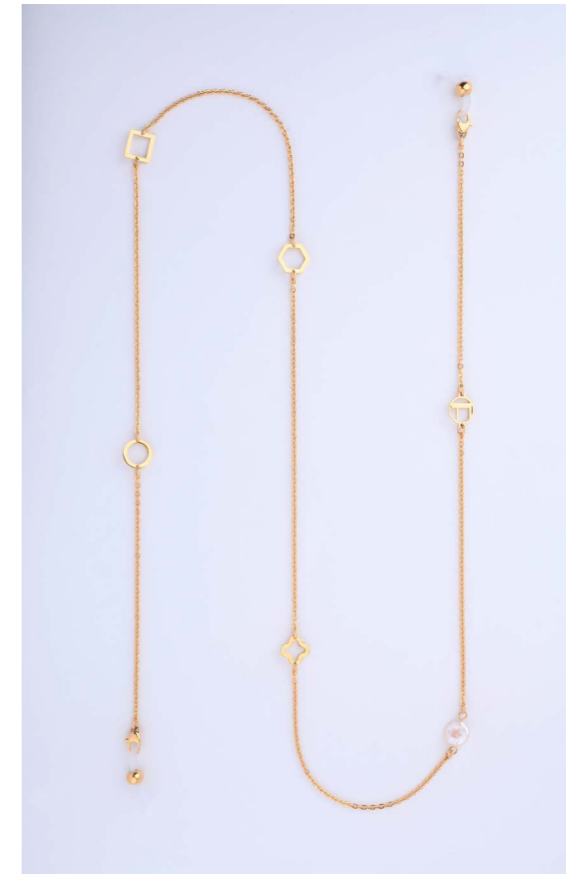
CH-091 Hampstead Gold