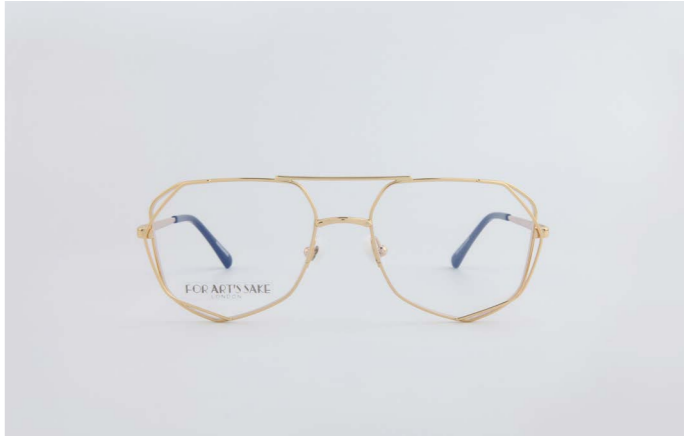
OP572 Genius Two Gold