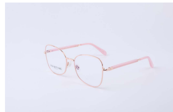
OP614 Grace Pink