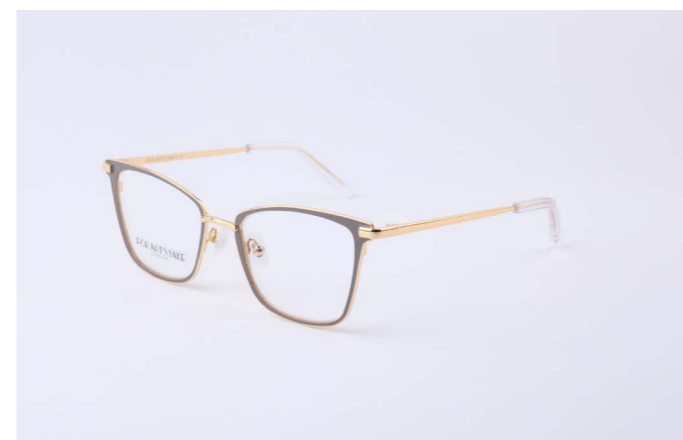
OP623 Windsor Ash