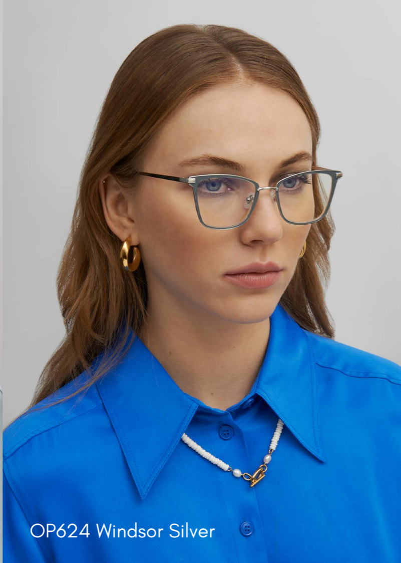
OP624 Windsor Silver