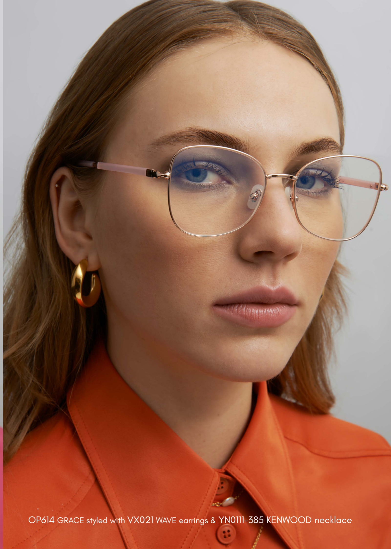
OP614 GRACE styled with VX021 WAVE earrings & YN0111-385 KENWOOD necklace