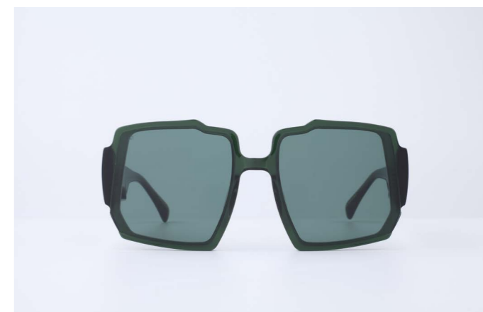
SC4 Moritz Green / Green tinted lens