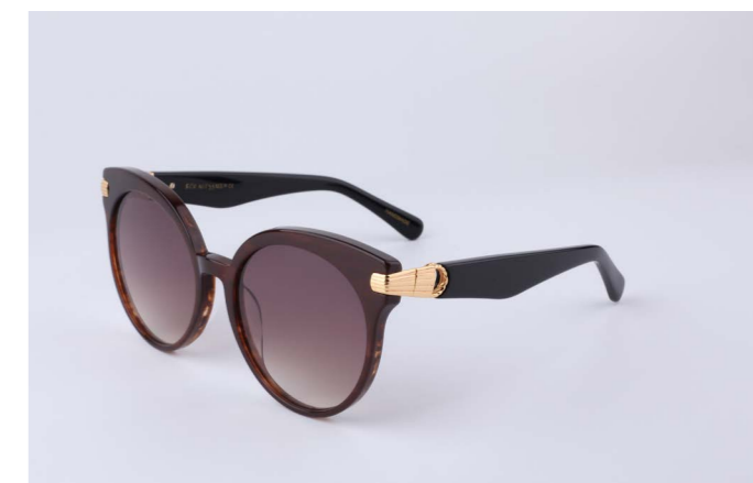
SK2 Muse Champagne / Champagne gradient lens