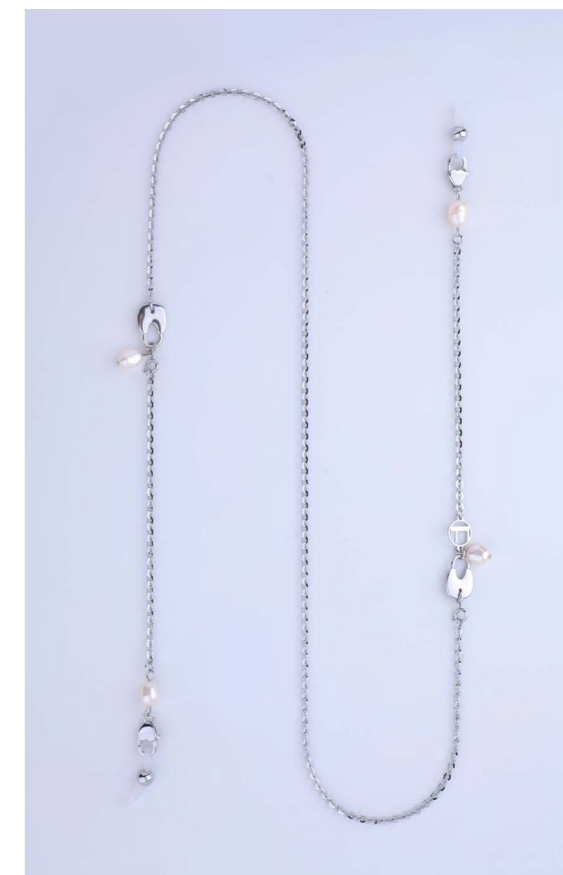
CH-132 Belgravia Silver