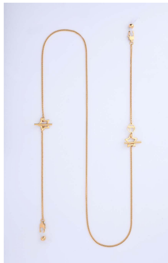
CH-111 Little Venice Gold