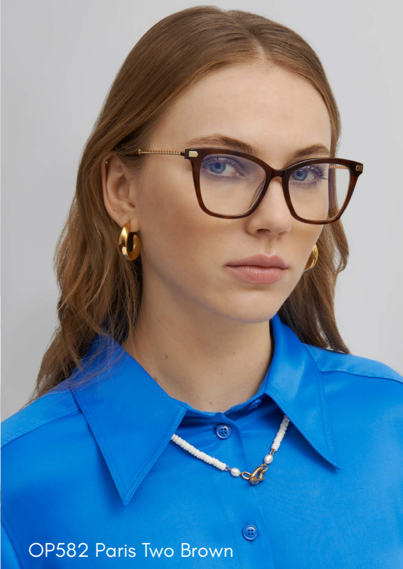
OP582 Paris Two Brown