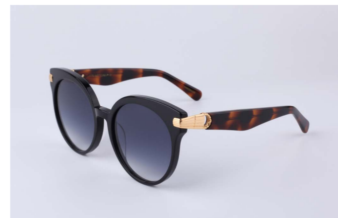
SK1 Muse Black / Black gradient lens