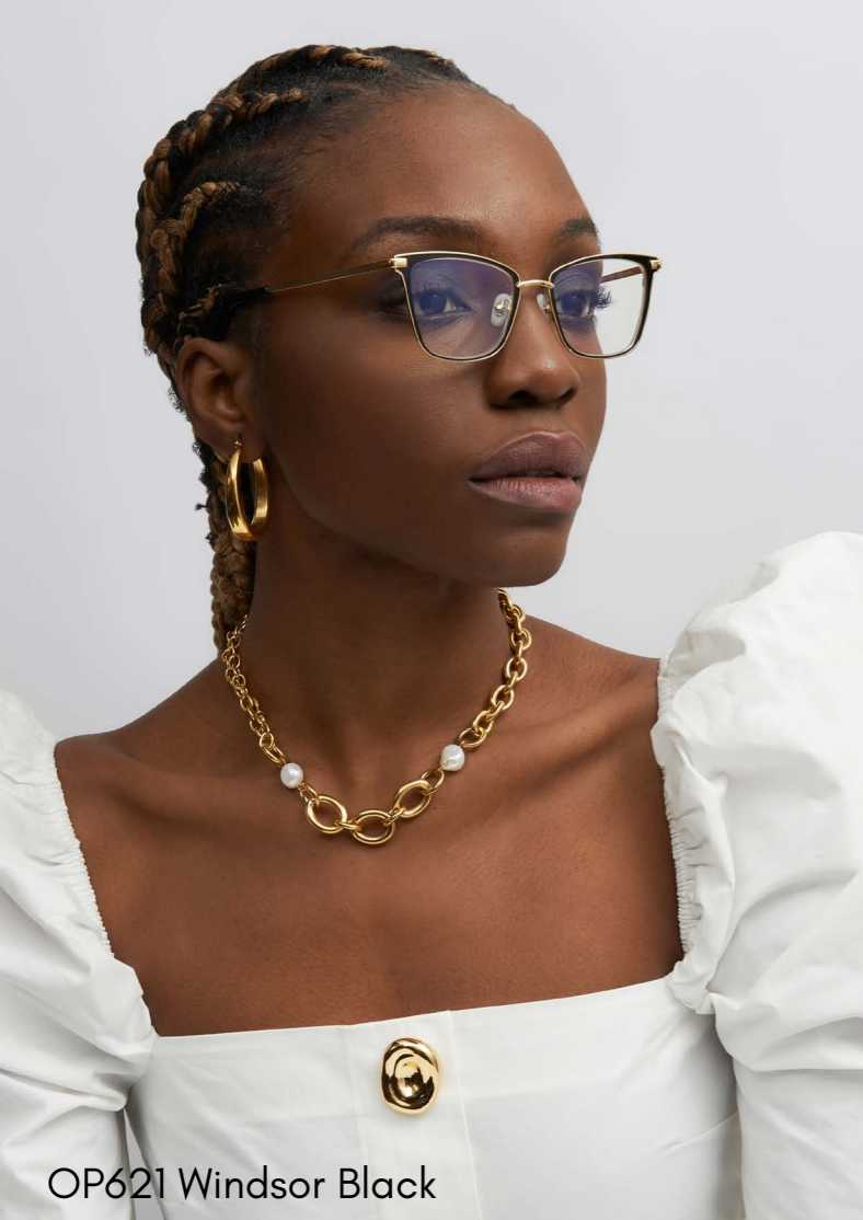
OP621 Windsor Black