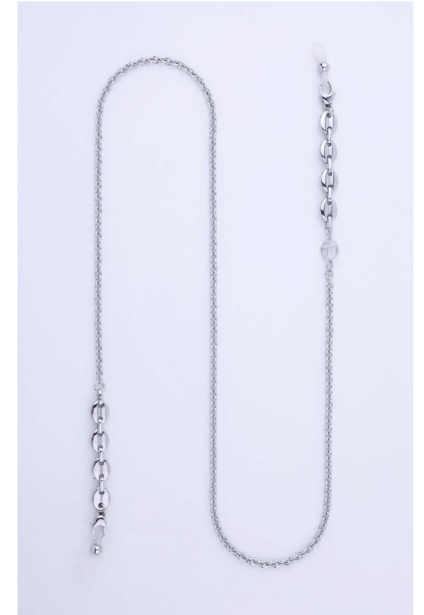
CH-122 Hackney Silver