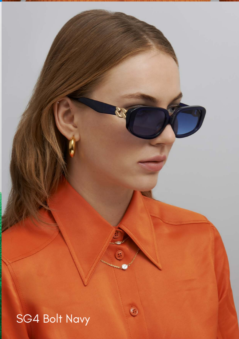
SG4 Bolt Navy