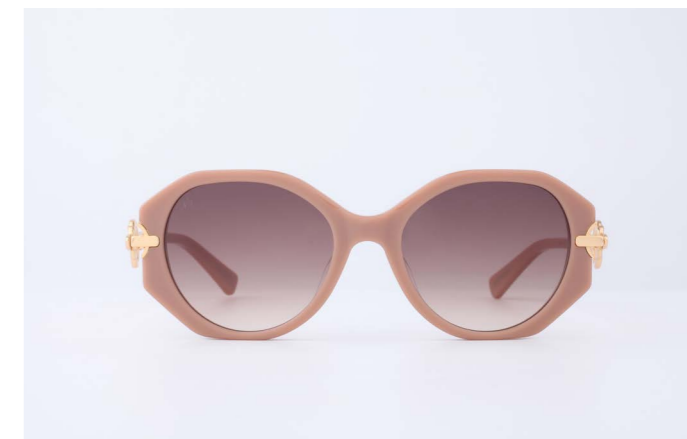
SP2 Seaside Champagne / Champagne gradient lens