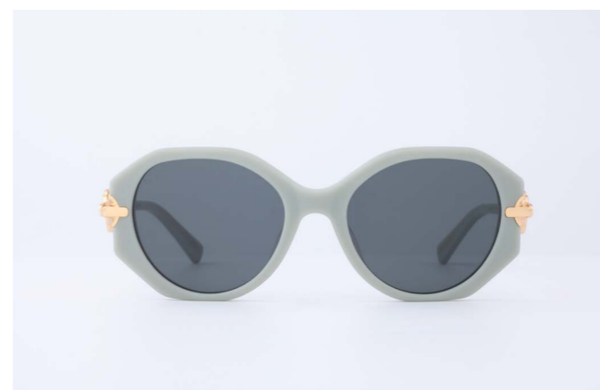
SP3 Seaside Green / Black tinted lens