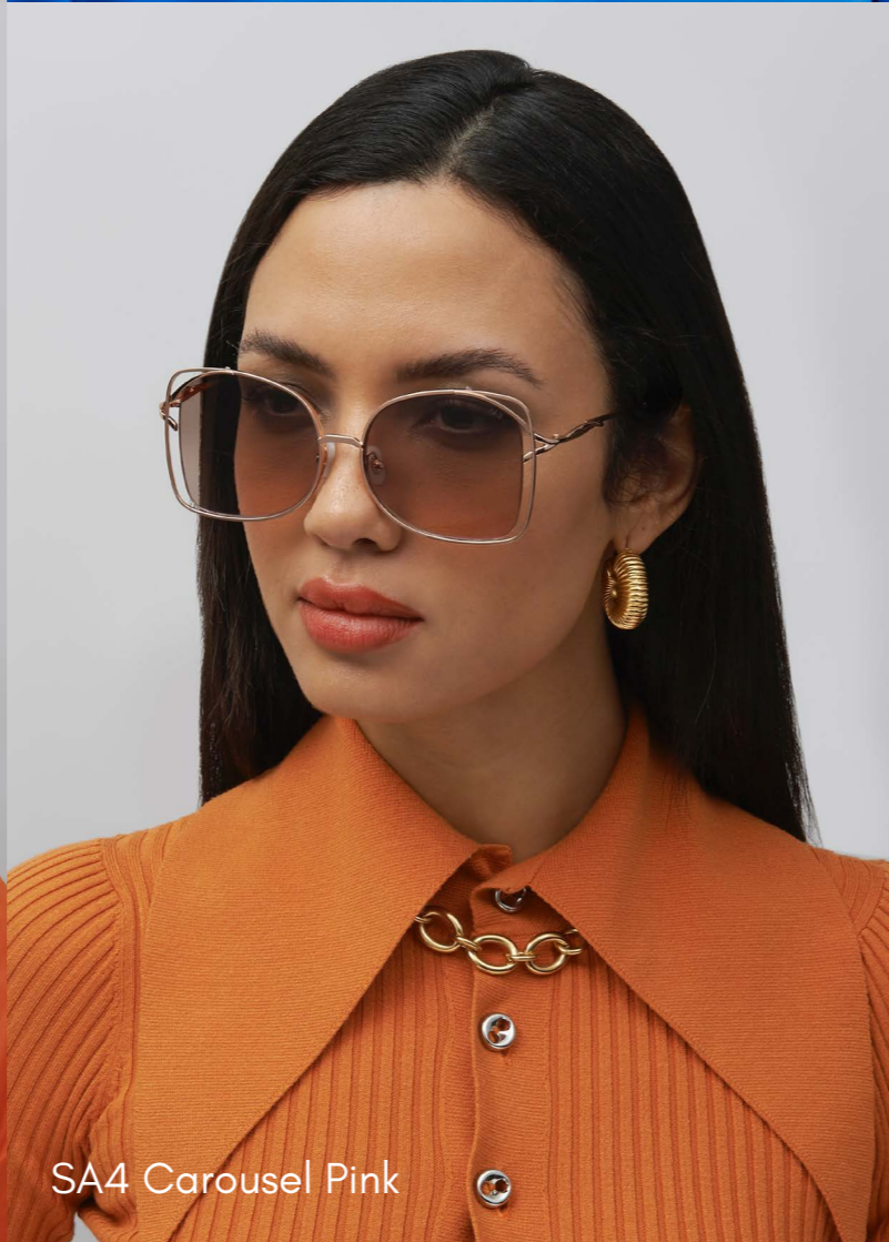
SA4 Carousel Pink