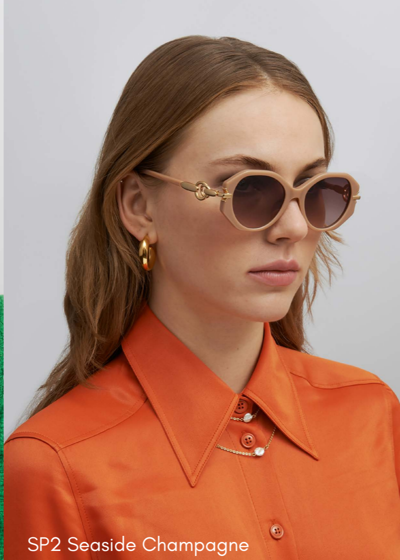
SP2 Seaside Champagne