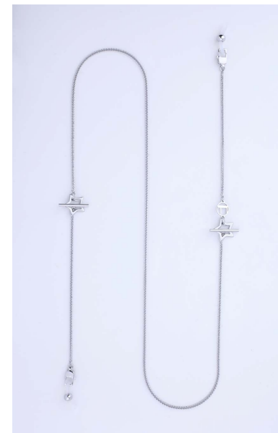
CH-112 Little Venice Silver