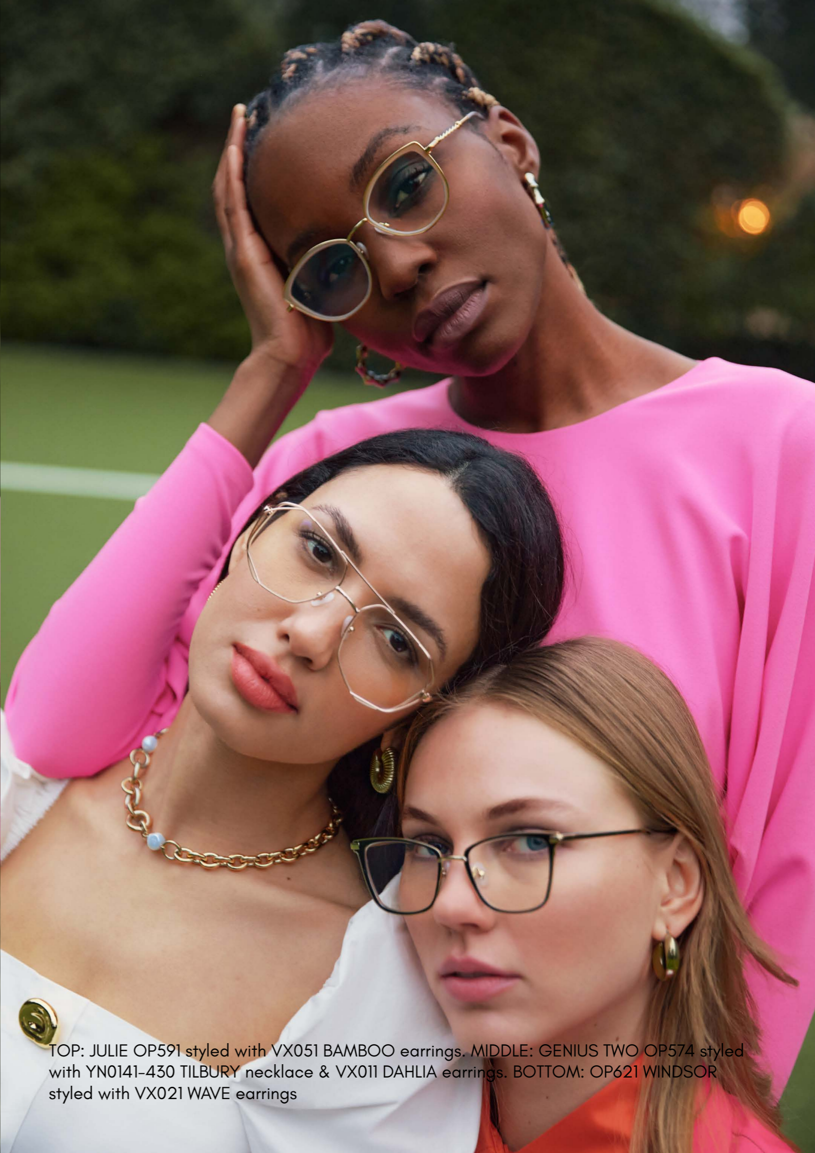
TOP: JULIE OP591 styled with VX051 BAMBOO earrings. MIDDLE: GENIUS TWO OP574 styled with YN0141-430 TILBURY necklace & VX011 DAHLIA earrings. BOTTOM: OP621 WINDSOR styled with VX021 WAVE earrings