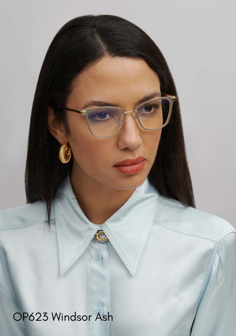
OP623 Windsor Ash