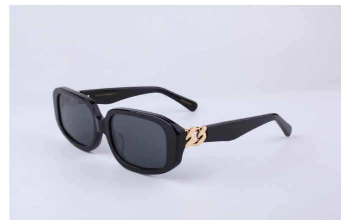
SG1 Bolt Black / Black tinted lens