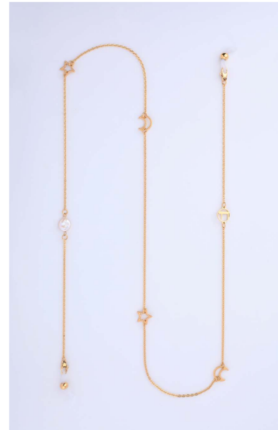
CH-081 Brixton Gold