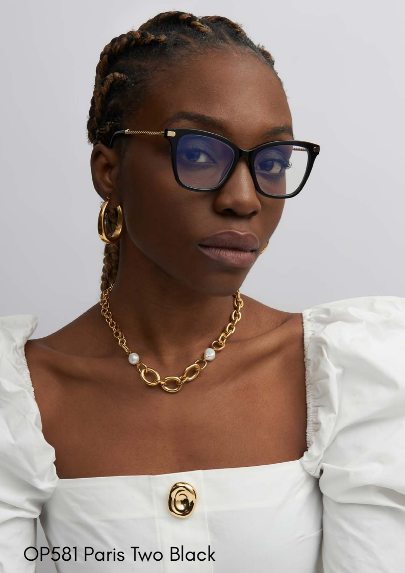
OP581 Paris Two Black