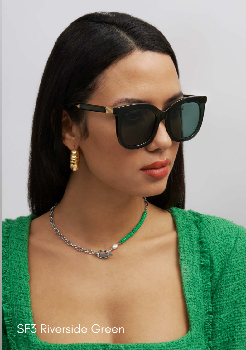
SF3 Riverside Green