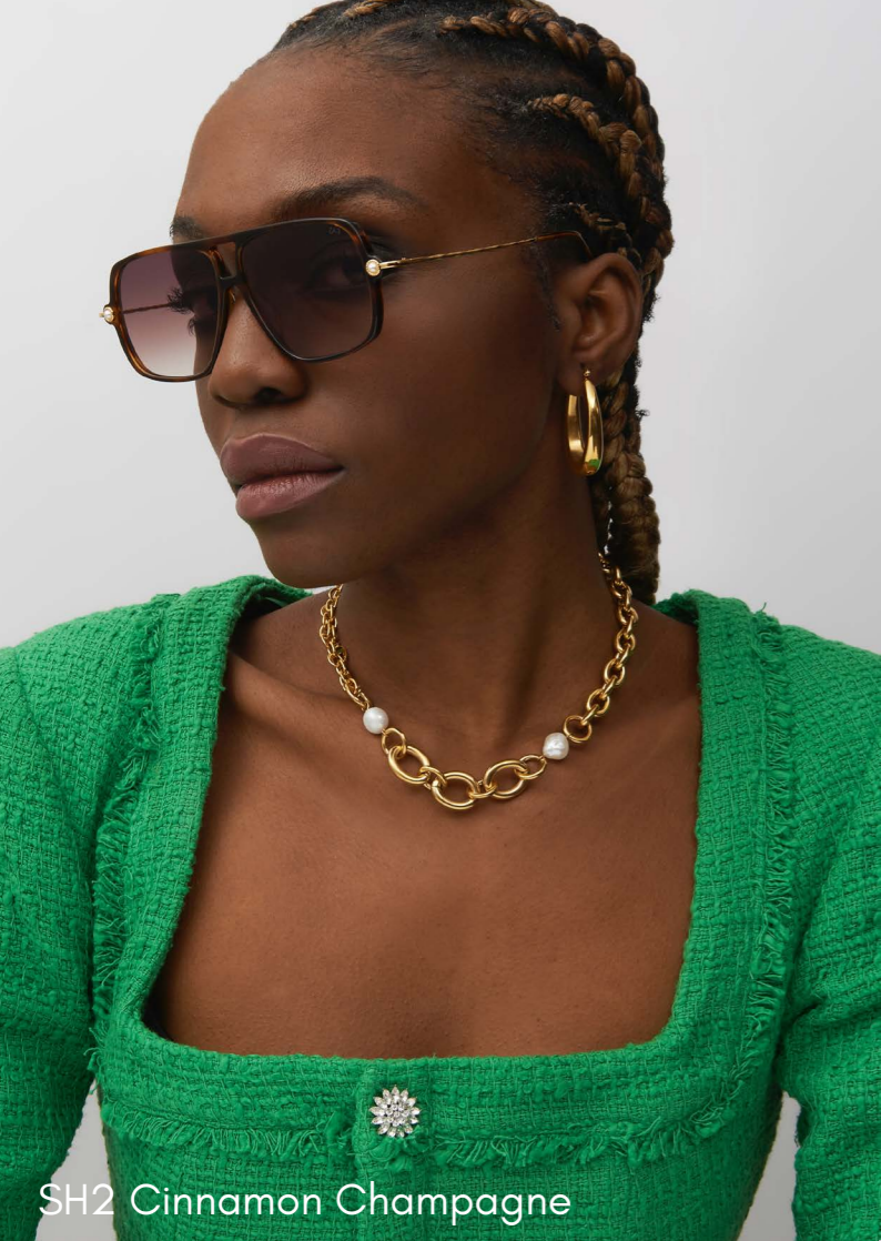
SH2 Cinnamon Champagne