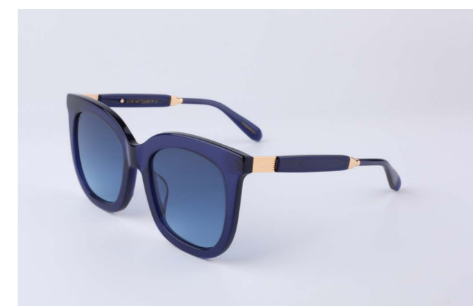
SF4 Riverside Navy / Blue gradient lens