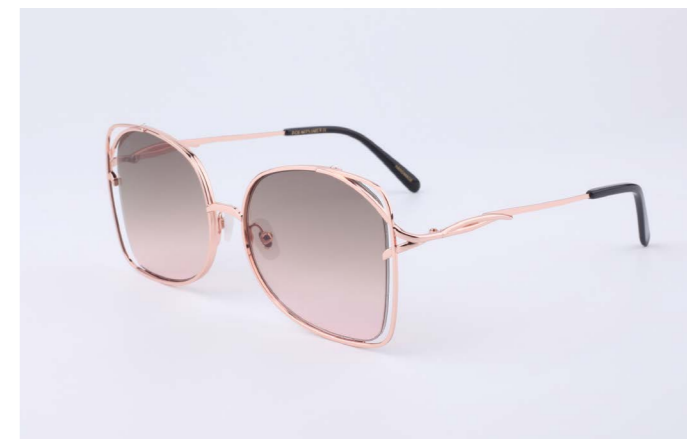
SA4 Carousel Pink / Pink gradient lens