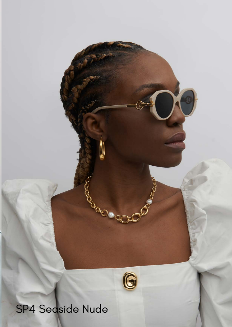
SP4 Seaside Nude