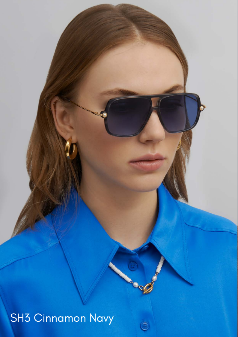
SH3 Cinnamon Navy