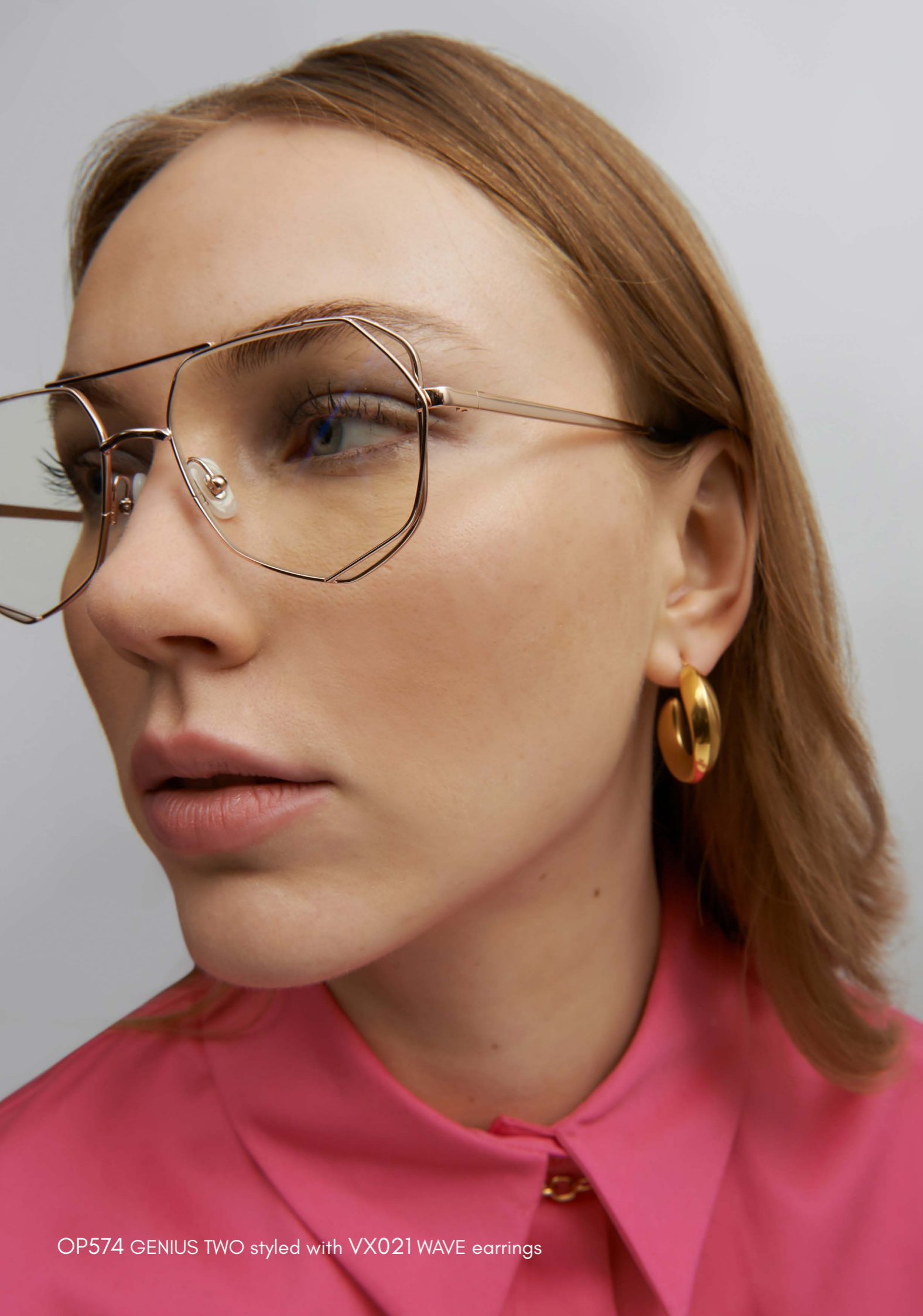
OP574 GENIUS TWO styled with VX021 WAVE earrings