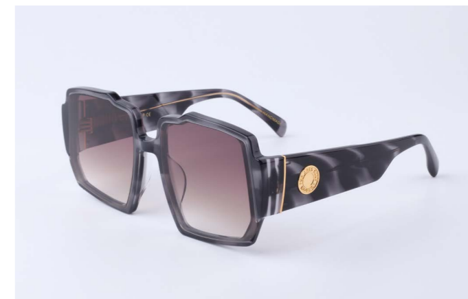
SC2 Moritz Champagne / Champagne gradient lens