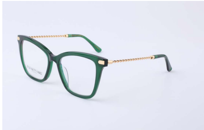
OP584 Paris Two Green