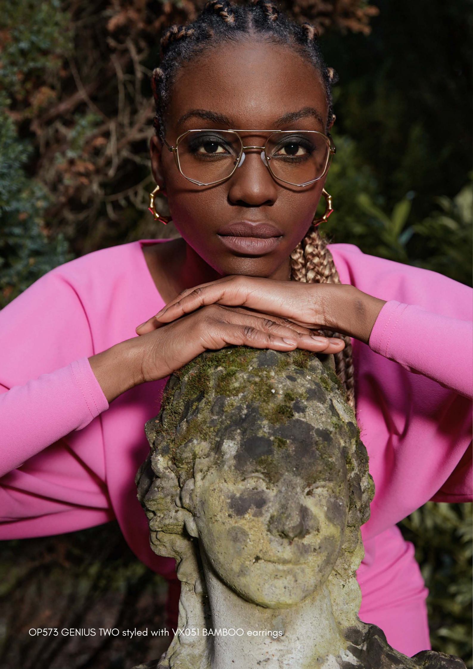
OP573 GENIUS TWO styled with VX051 BAMBOO earrings