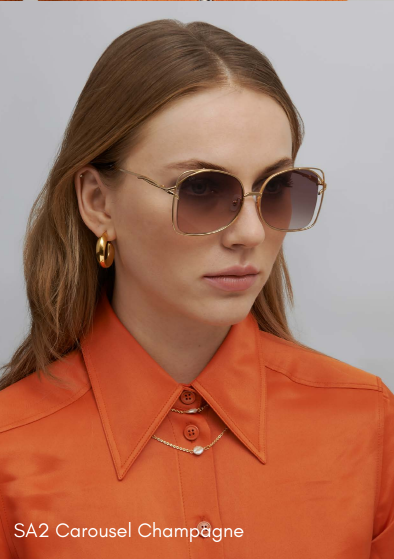
SA2 Carousel Champagne