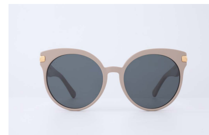
SK4 Muse Nude / Black tinted lens