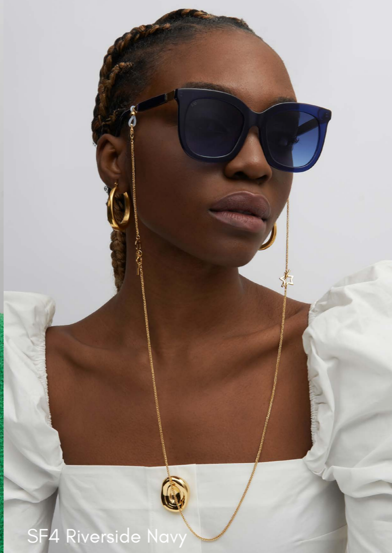
SF4 Riverside Navy