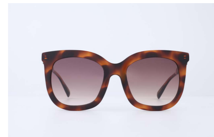
SF2 Riverside Champagne / Champagne gradient lens