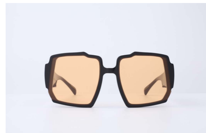
SC3 Moritz Amber / Amber tinted lens