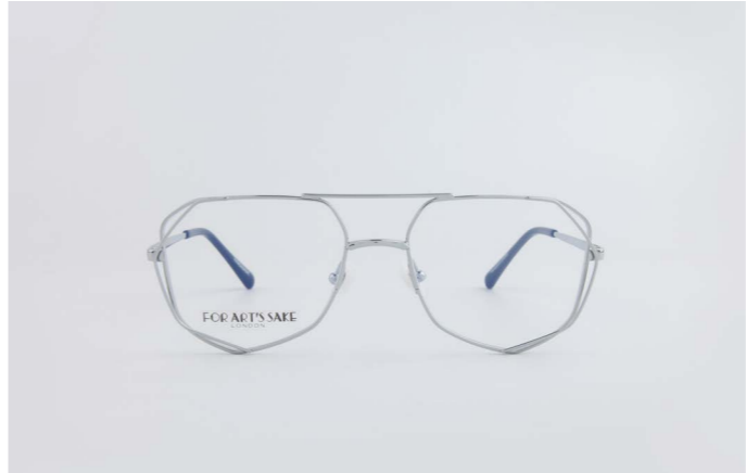
OP573 Genius Two Silver