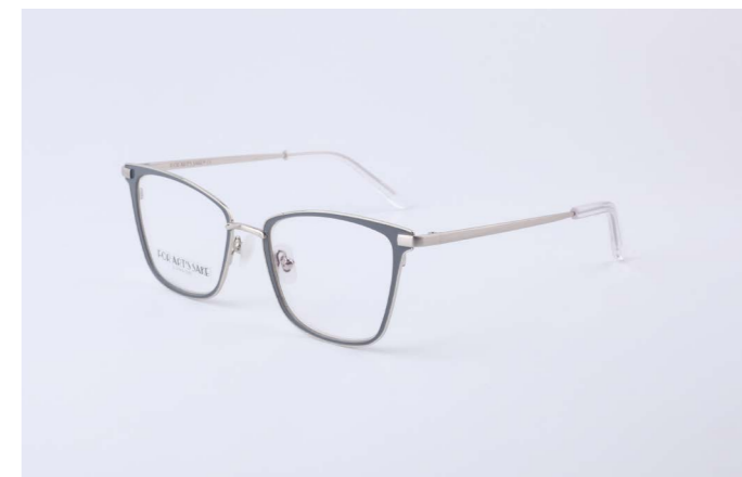
OP624 Windsor Silver