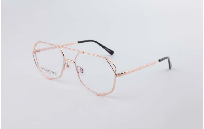
OP574 Genius Two Rose