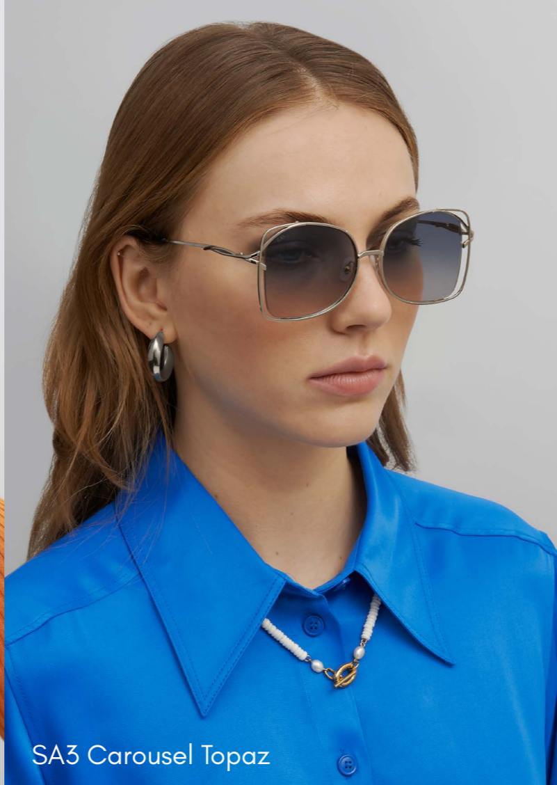
SA3 Carousel Topaz