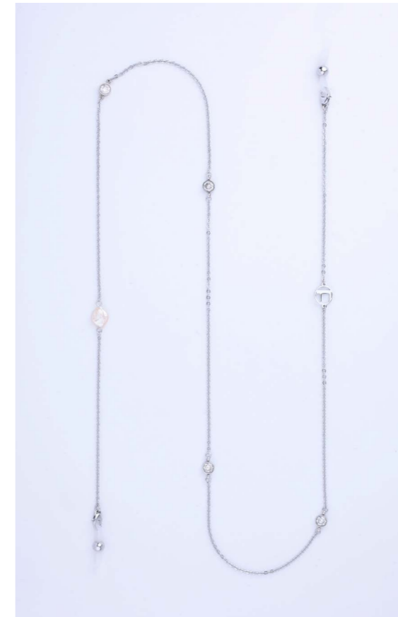
CH-102 Wimbledon Silver