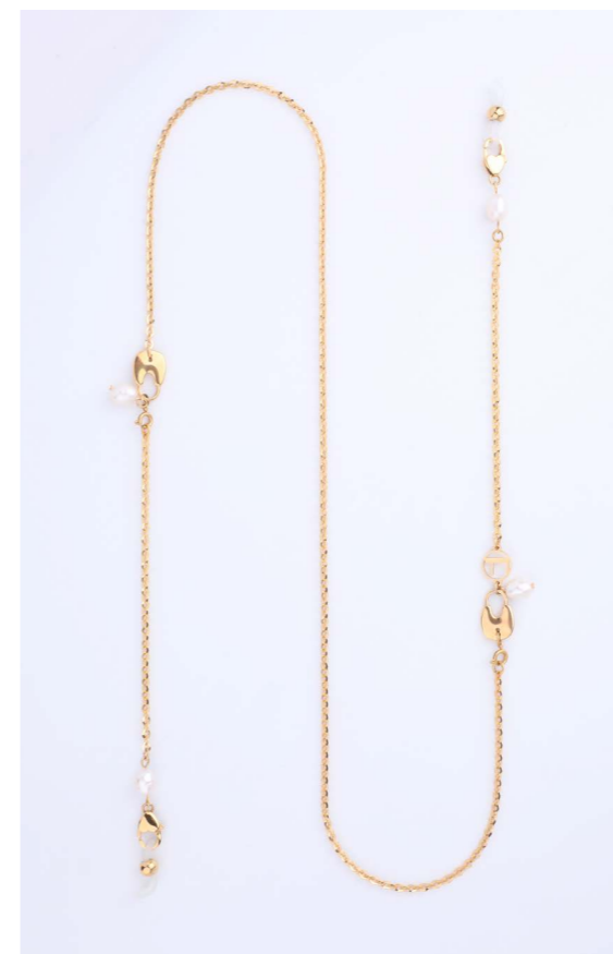
CH-131 Belgravia Gold