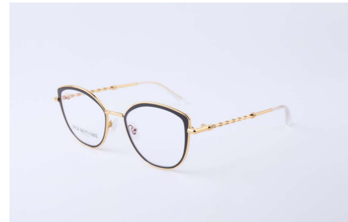
OP593 Julie Black