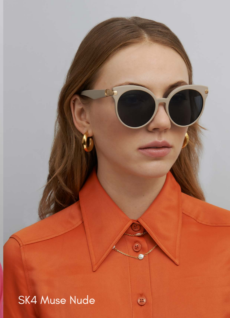
SK4 Muse Nude