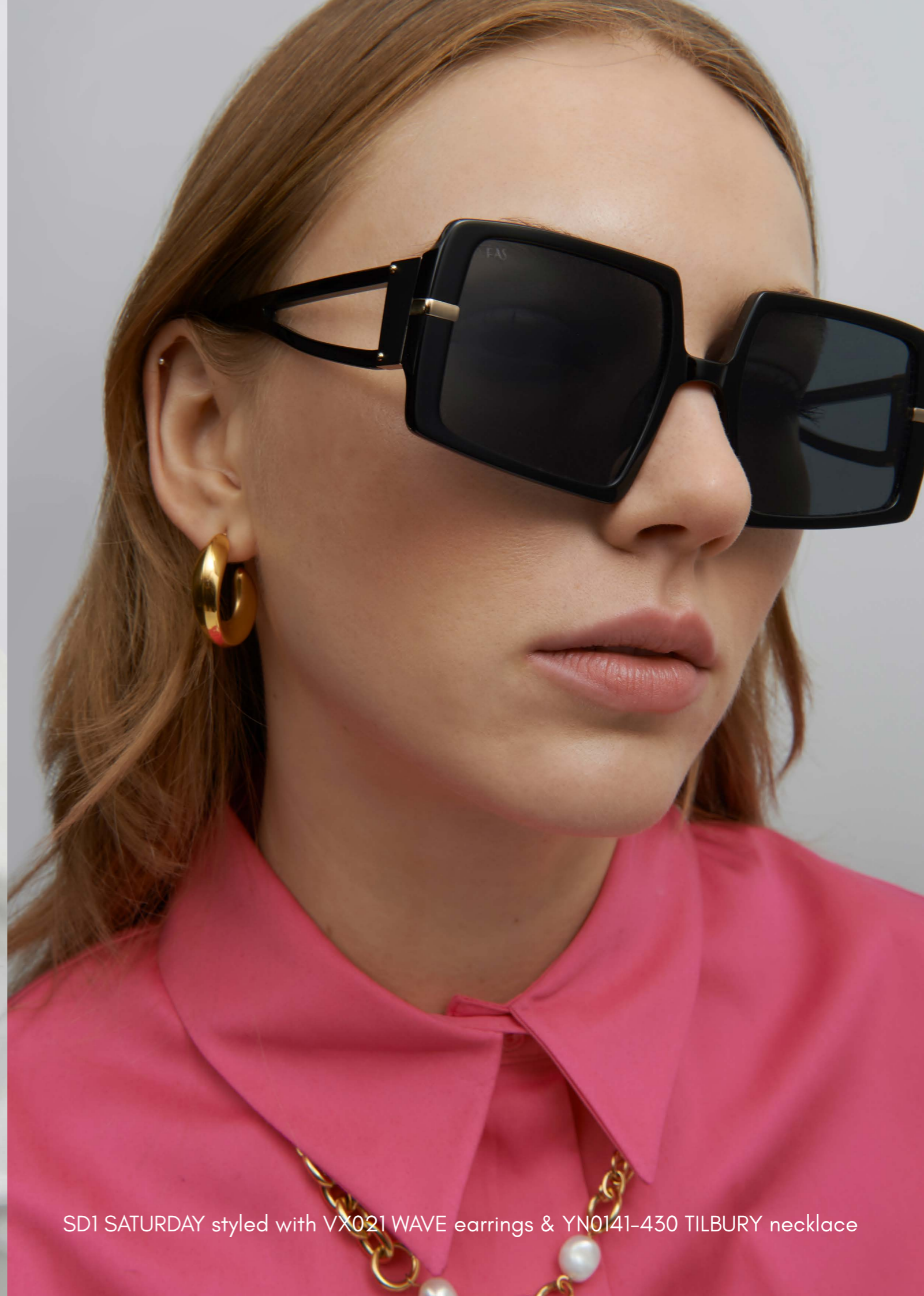
SD1 SATURDAY styled with VX021 WAVE earrings & YN0141-430 TILBURY necklace