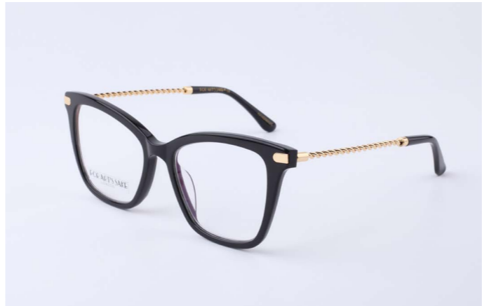
OP581 Paris Two Black