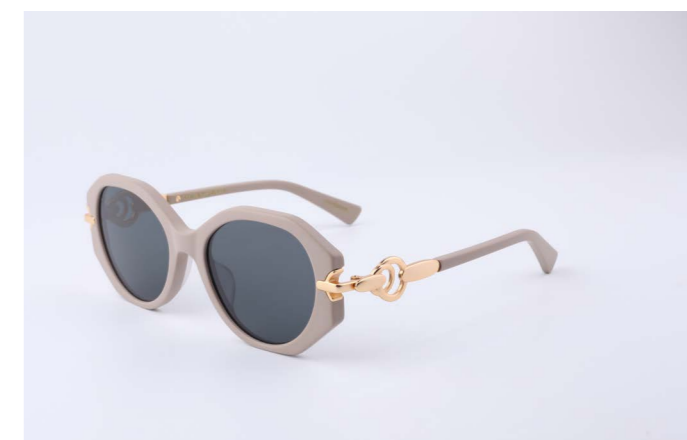
SP4 Seaside Nude / Black tinted lens