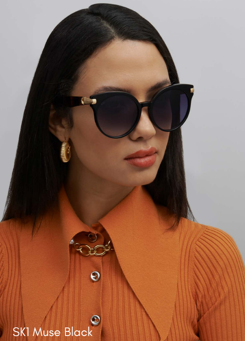
SK1 Muse Black