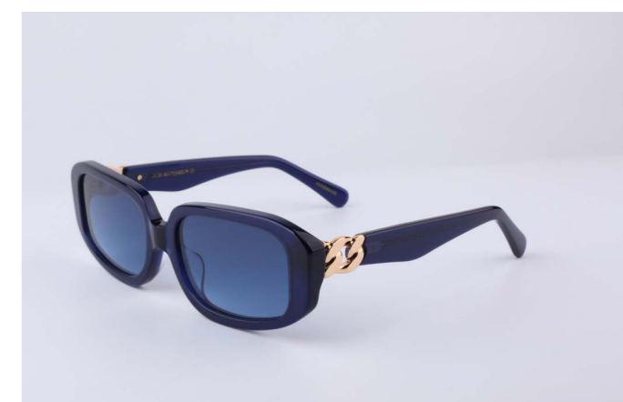
SG4 Bolt Navy / Blue gradient lens