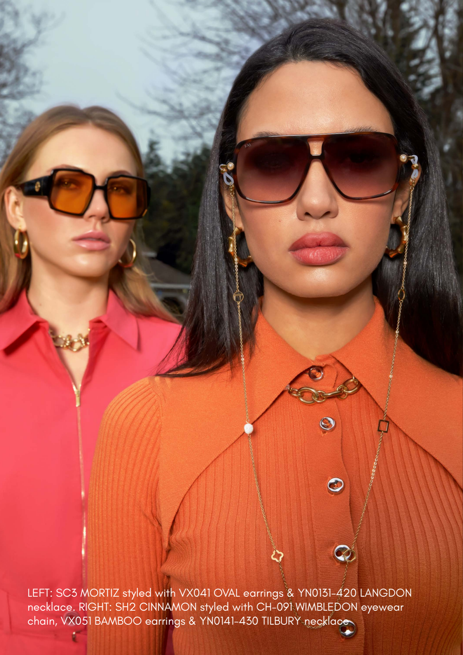
LEFT: SC3 MORTIZ styled with VX041 OVAL earrings & YN0131-420 LANGDON necklace. RIGHT: SH2 CINNAMON styled with CH-091 WIMBLEDON eyewear chain, VX051 BAMBOO earrings & YN0141-430 TILBURY necklace