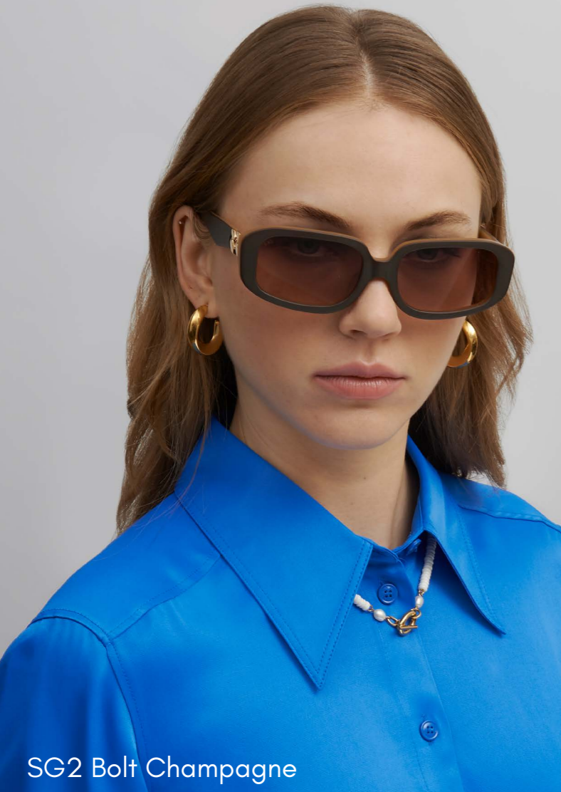
SG2 Bolt Champagne