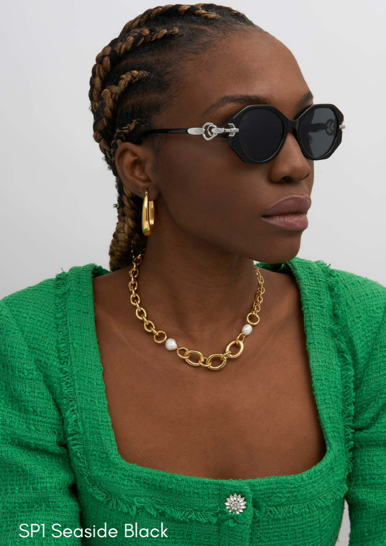
SP1 Seaside Black