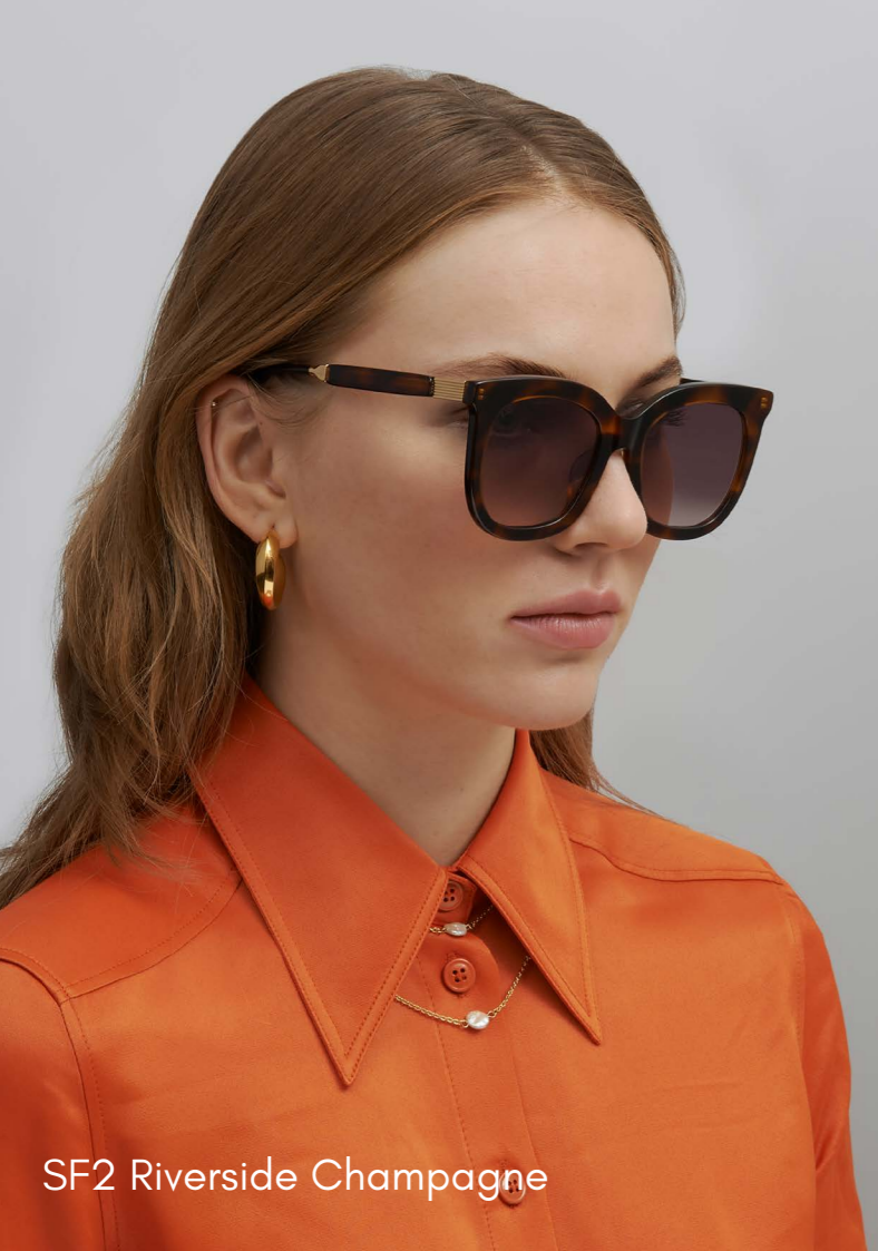
SF2 Riverside Champagne