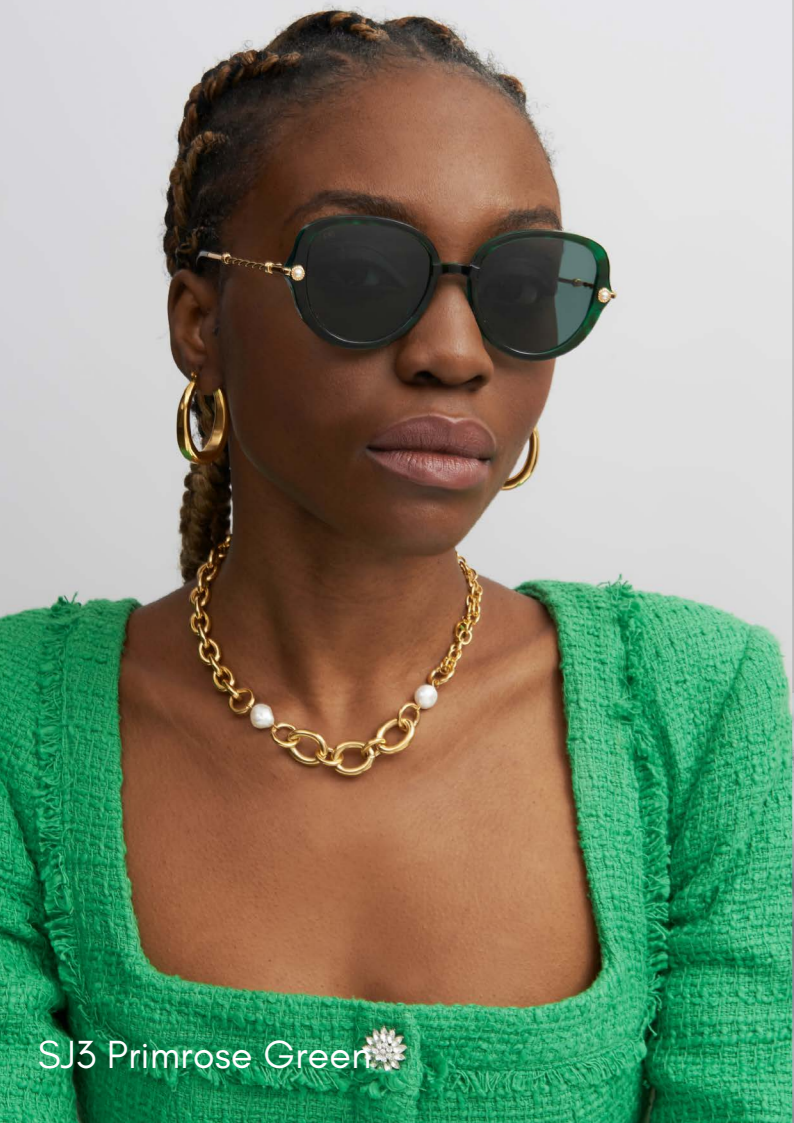
SJ3 Primrose Green