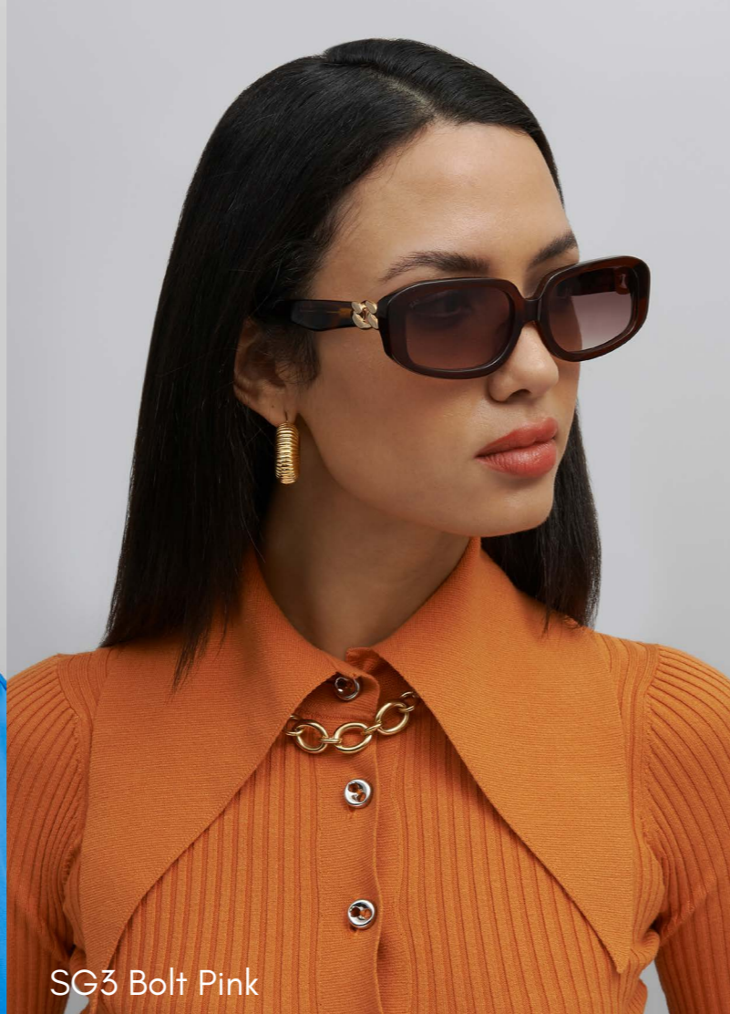
SG3 Bolt Pink