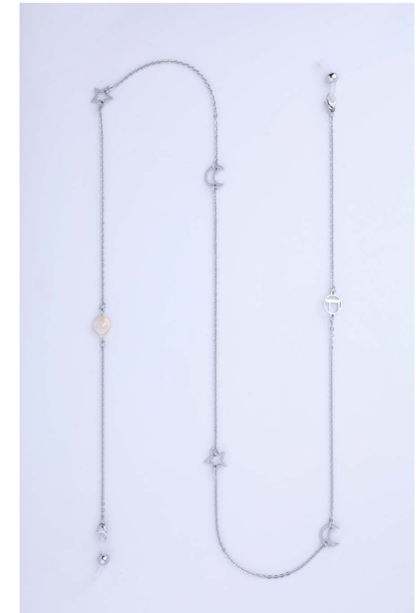
CH-082 Brixton Silver