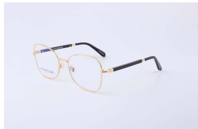
OP611 Grace Black