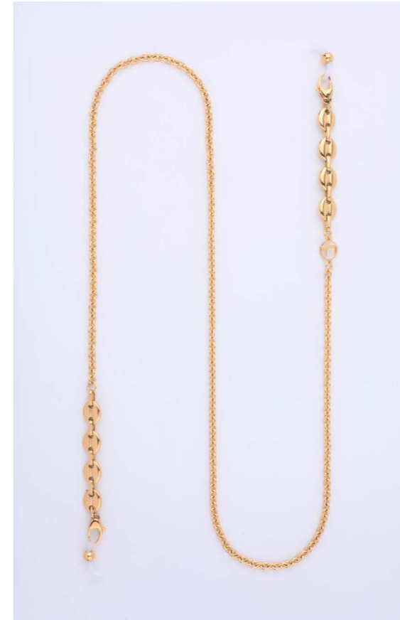
CH-121 Hackney Gold