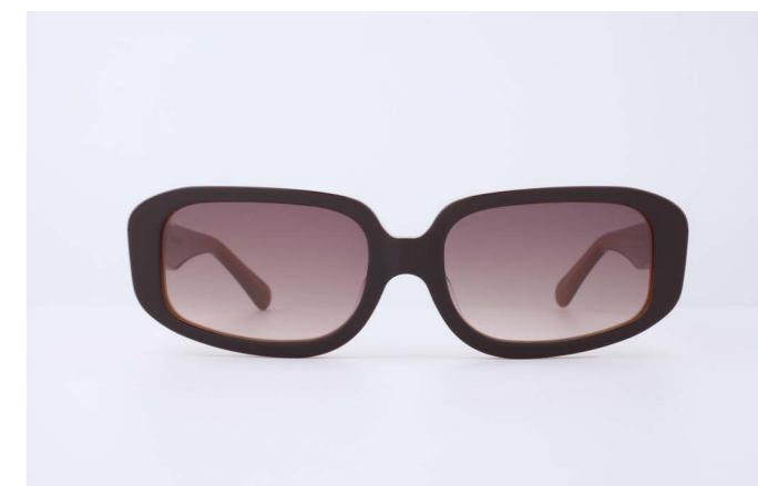
SG2 Bolt Champagne / Champagne gradient lens