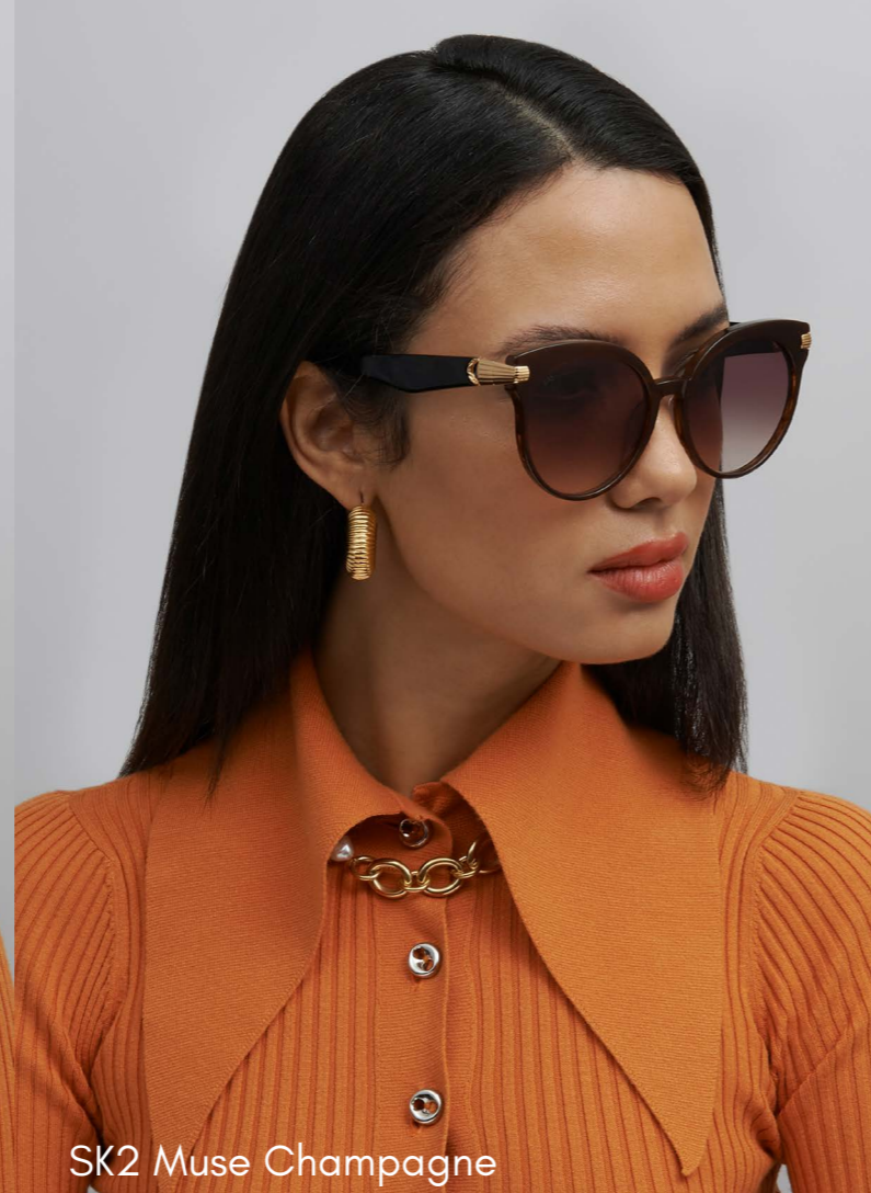
SK2 Muse Champagne