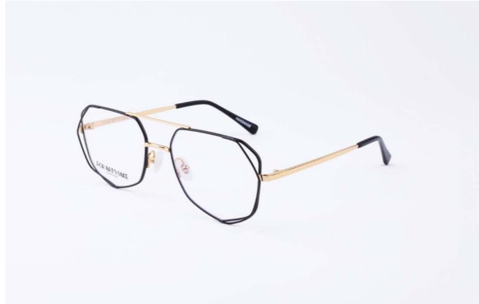
OP571 Genius Two Black