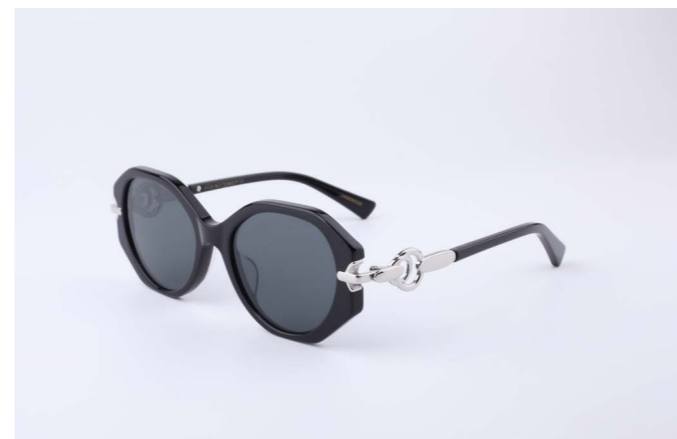
SP1 Seaside Black / Black tinted lens