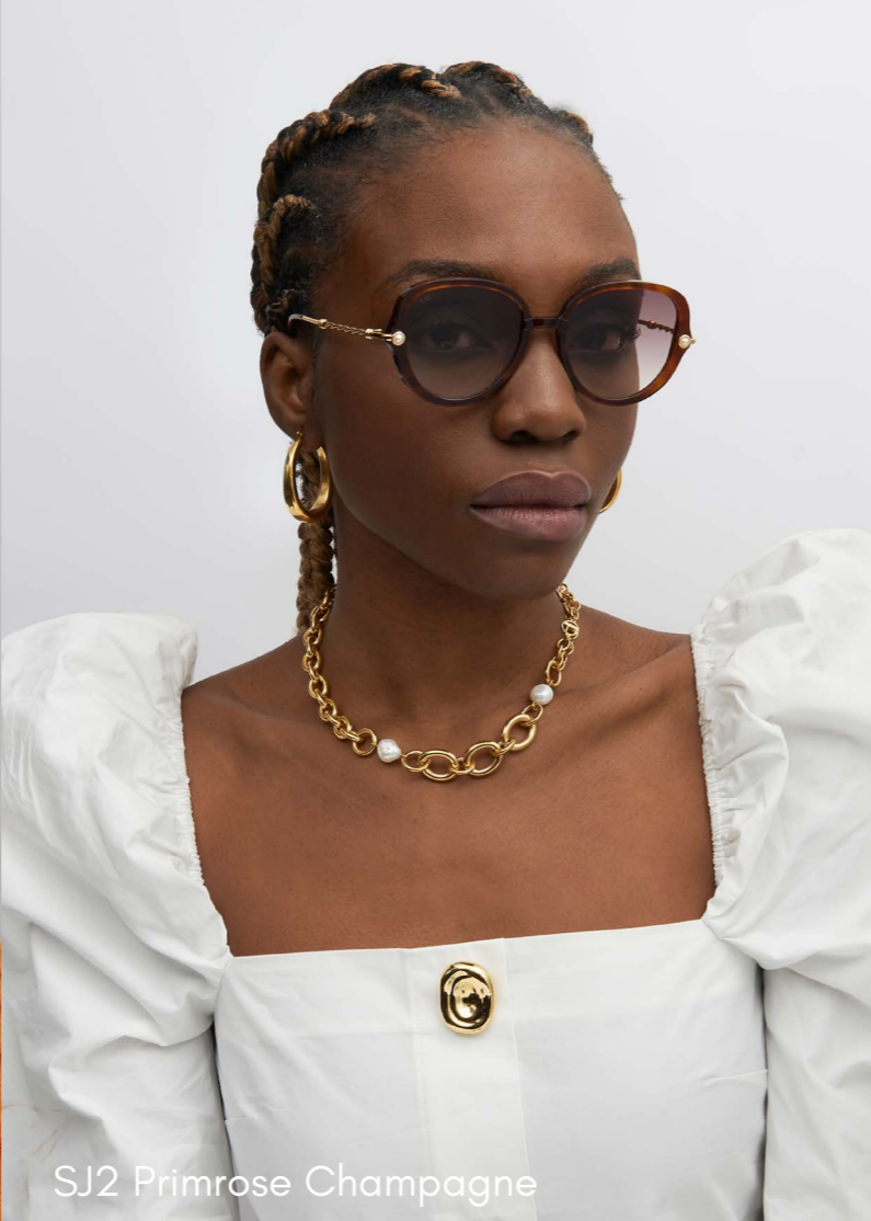
SJ2 Primrose Champagne