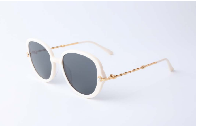
SJ4 Primrose White / Black tinted lens