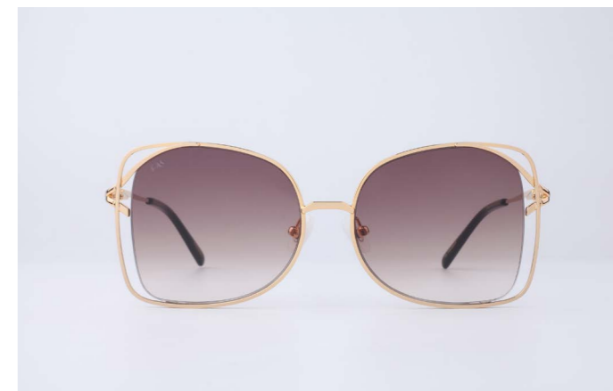
SA2 Carousel Champagne / Champagne gradient lens