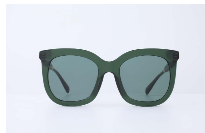
SF3 Riverside Green / Green tinted lens