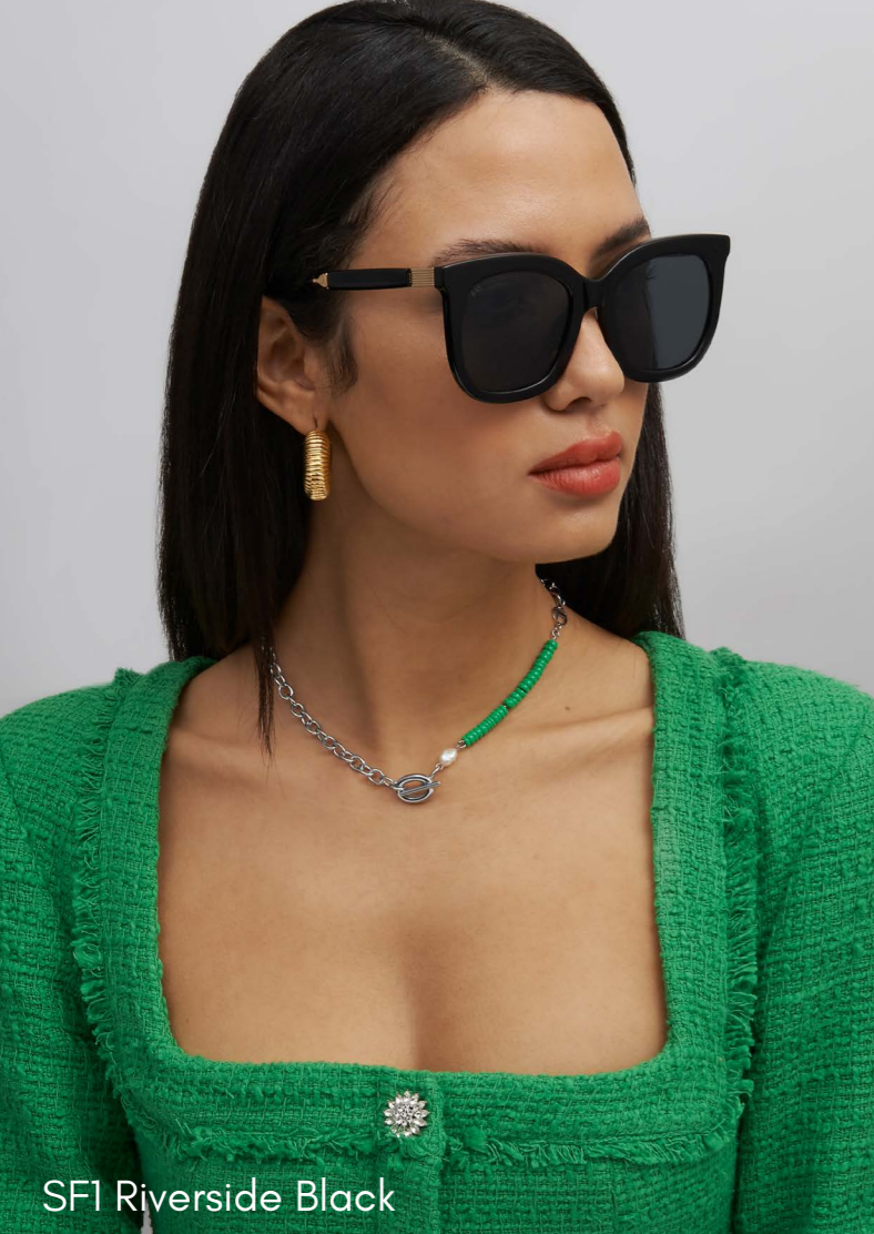
SF1 Riverside Black