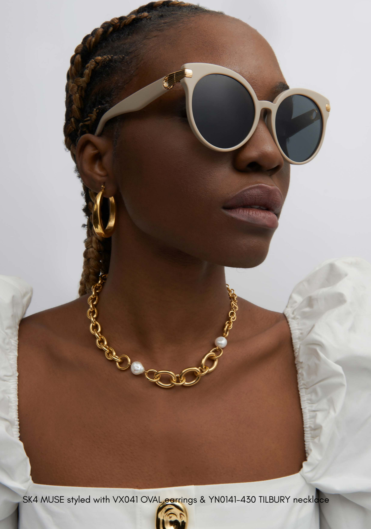
SK4 MUSE styled with VX041 OVAL earrings & YN0141-430 TILBURY necklace