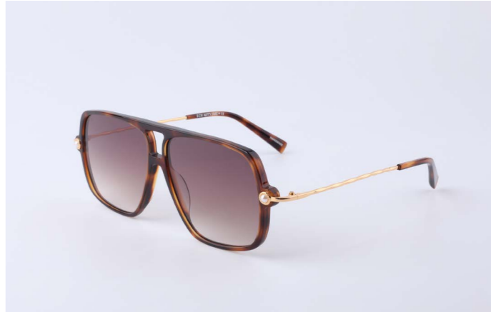
SH2 Cinnamon Champagne / Champagne gradient lens