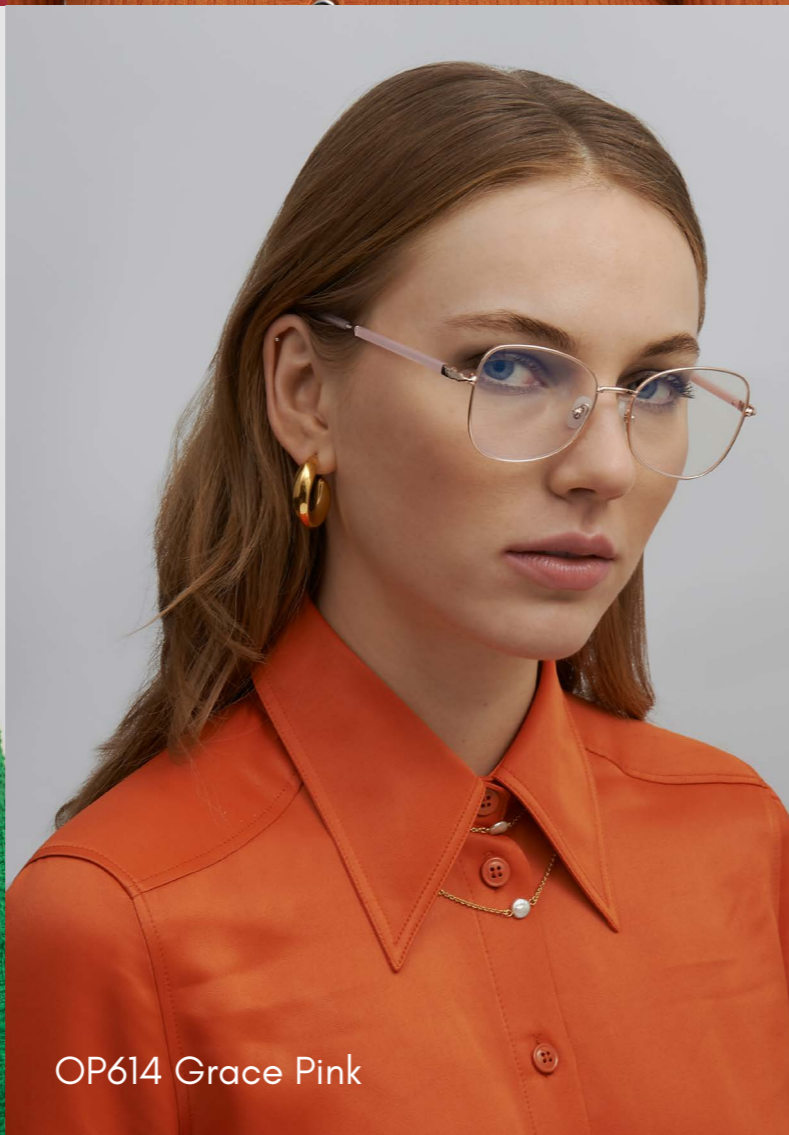
OP614 Grace Pink