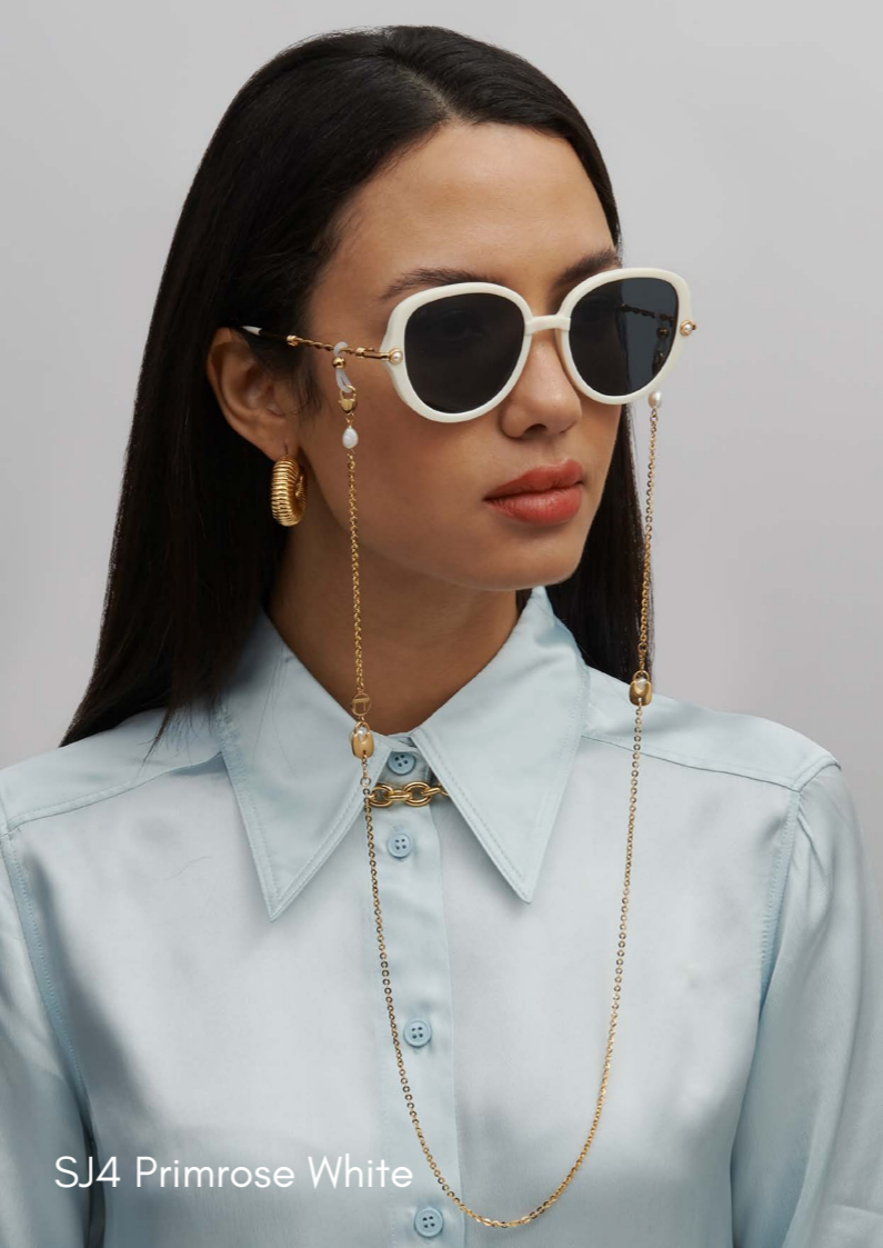
SJ4 Primrose White