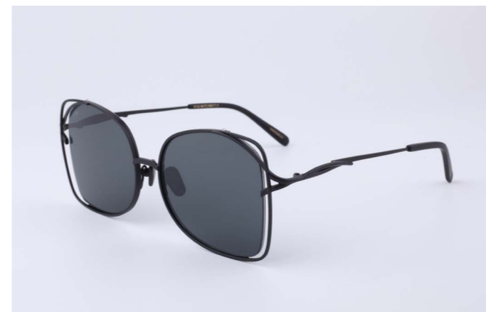
SA1 Carousel Black / Black tinted lens