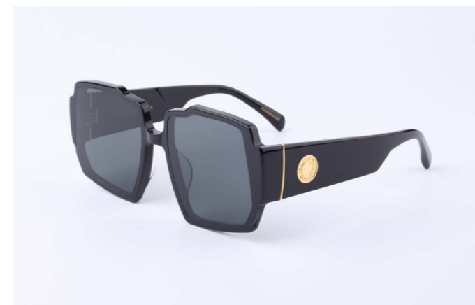
SC1 Moritz Black / Black tinted lens