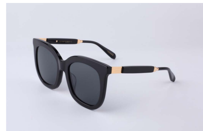
SF1 Riverside Black / Black tinted lens