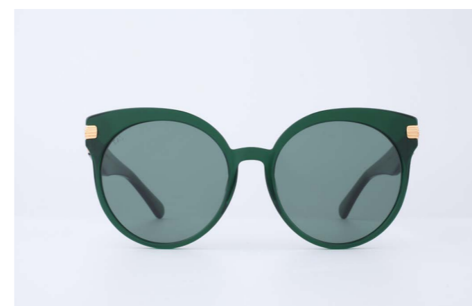
SK3 Muse Green / Green tinted lens