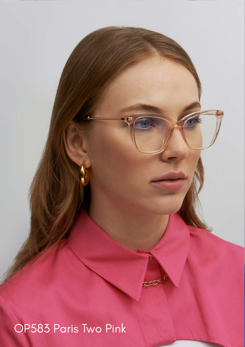
OP583 Paris Two Pink