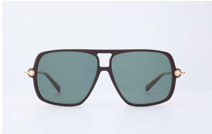
SH4 Cinnamon Green / Green tinted lens