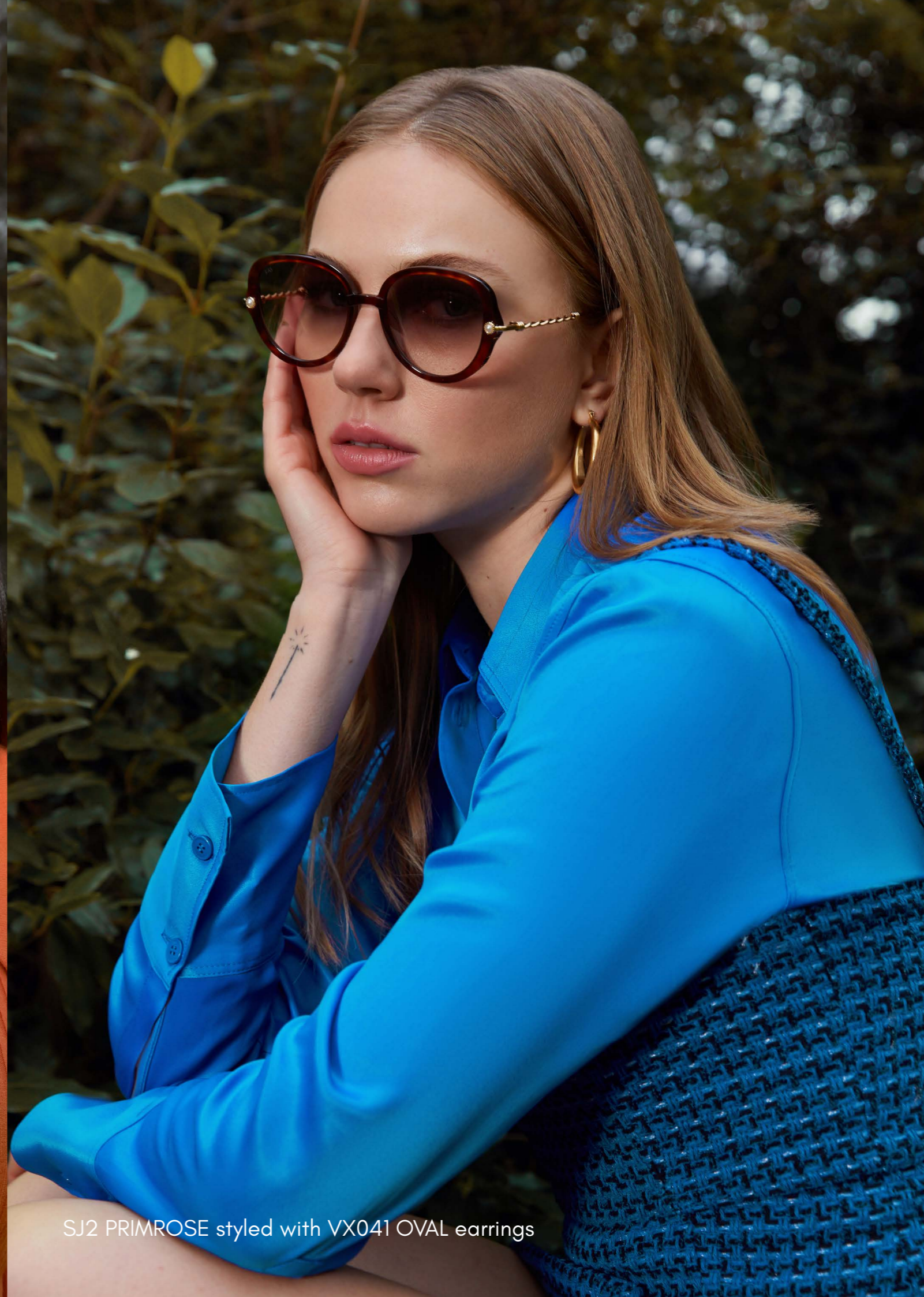
SJ2 PRIMROSE styled with VX041 OVAL earrings