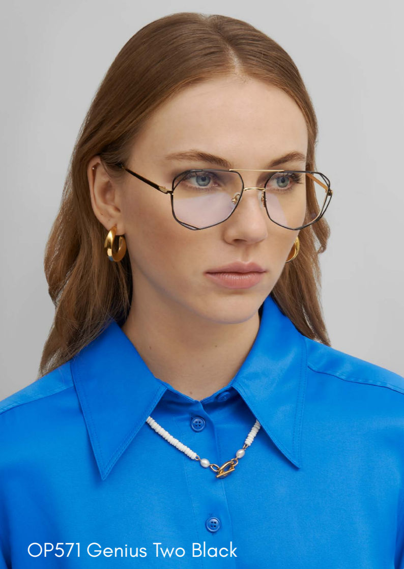
OP571 Genius Two Black