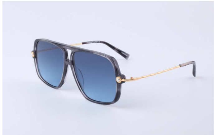
SH3 Cinnamon Navy / Blue gradient lens