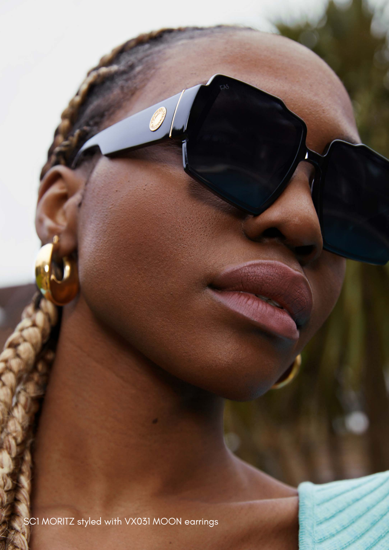
SC1 MORITZ styled with VX031 MOON earrings