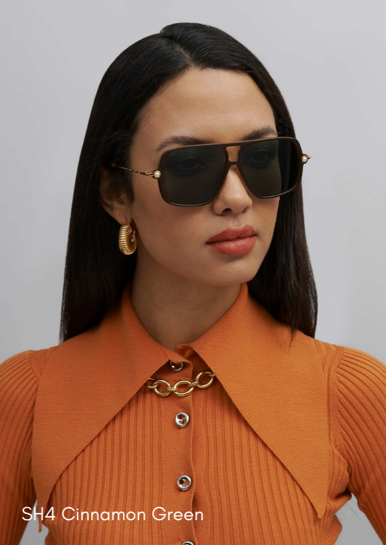
SH4 Cinnamon Green