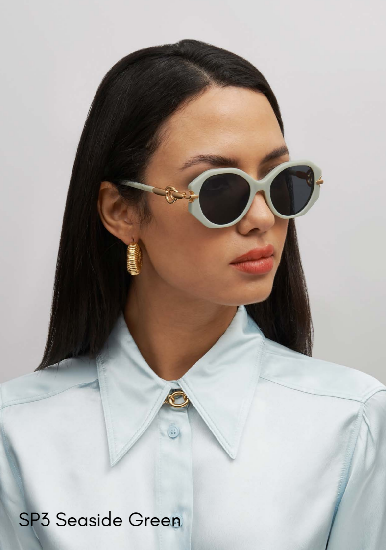
SP3 Seaside Green