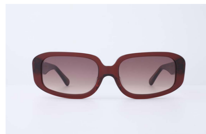
SG3 Bolt Pink / Champagne gradient lens