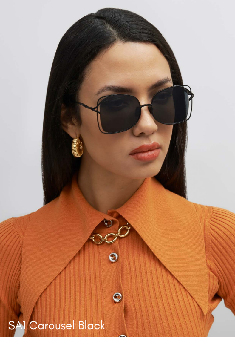
SA1 Carousel Black