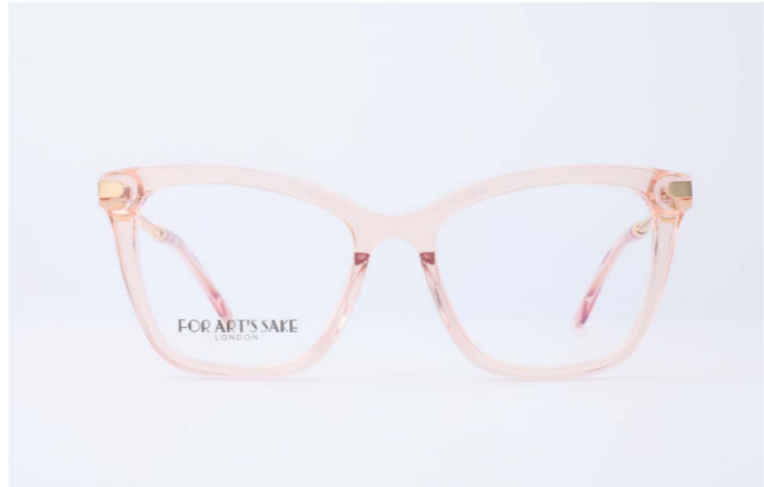
OP583 Paris Two Pink