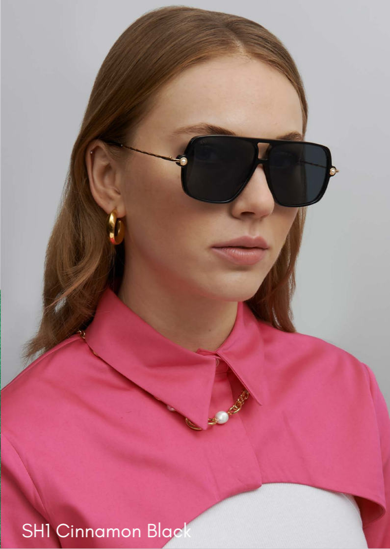
SH1 Cinnamon Black