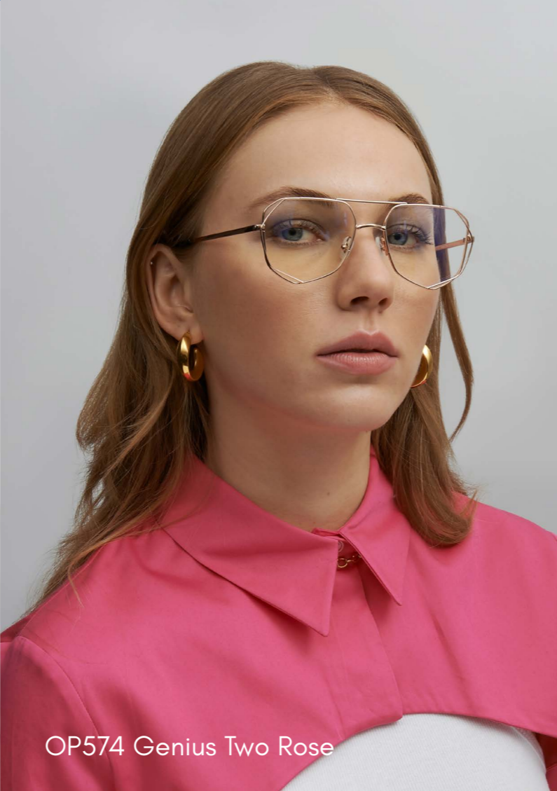
OP574 Genius Two Rose