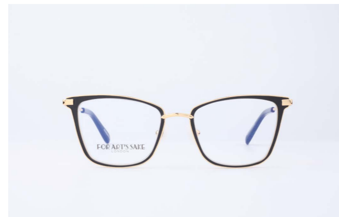
OP621 Windsor Black