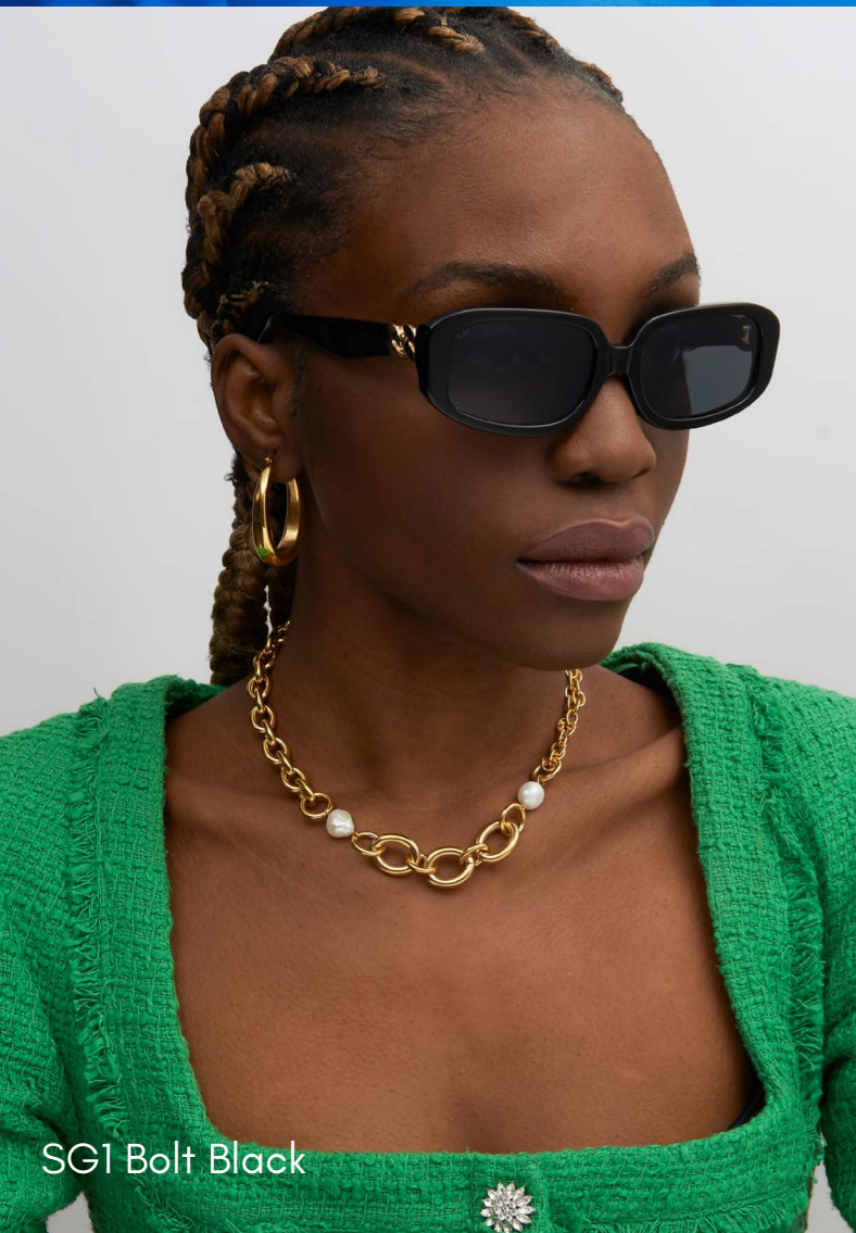
SG1 Bolt Black