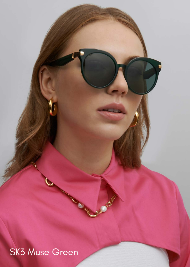
SK3 Muse Green