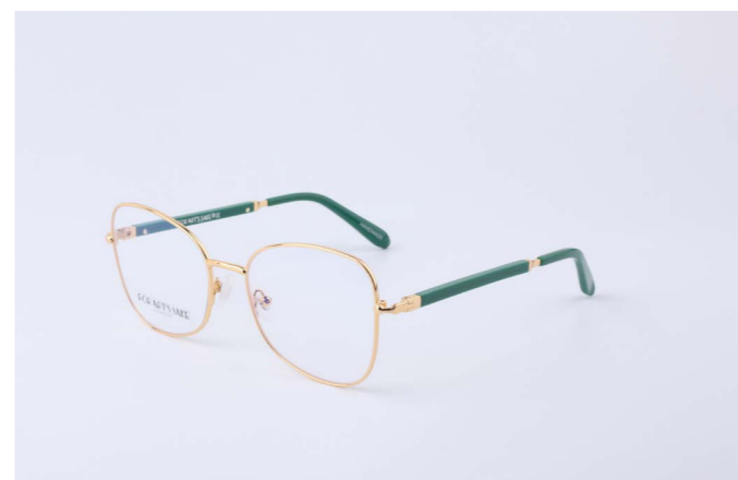
OP613 Grace Green