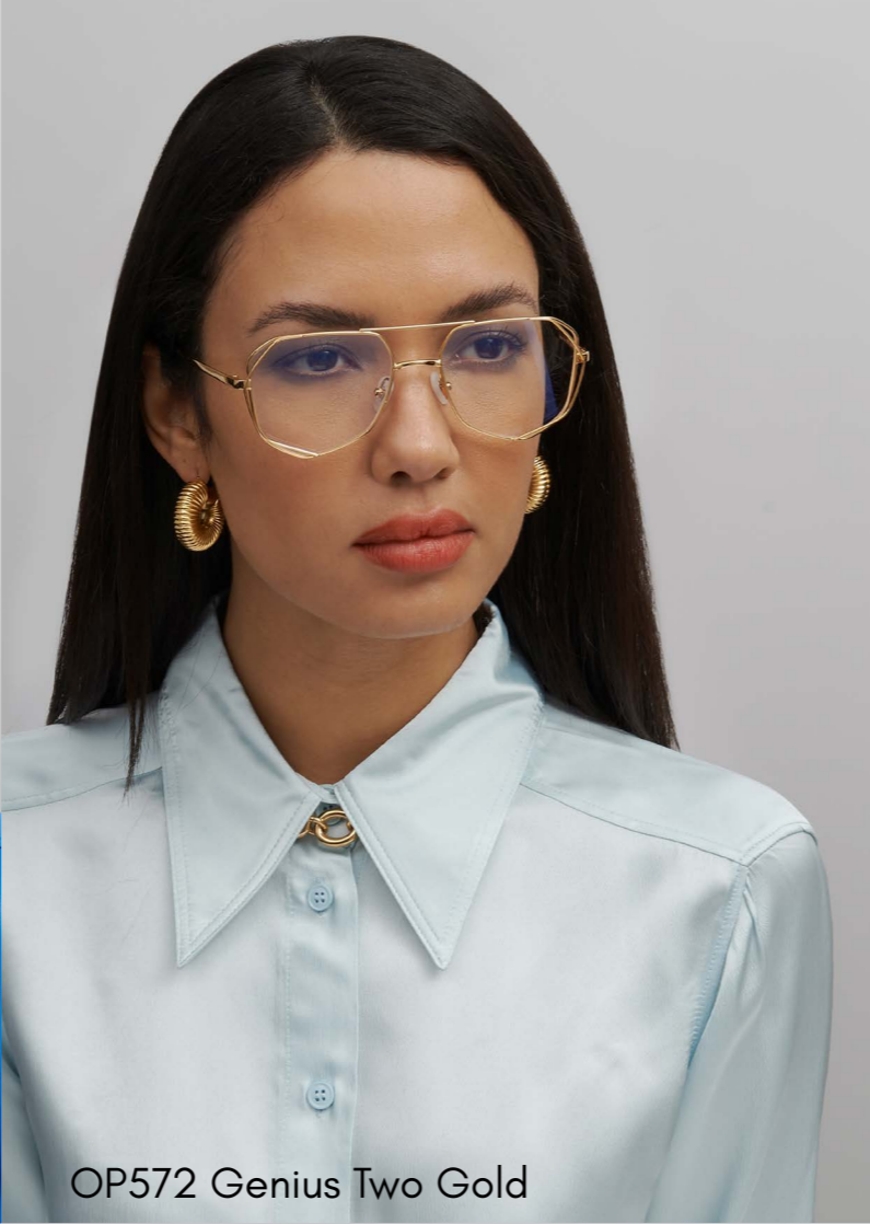
OP572 Genius Two Gold