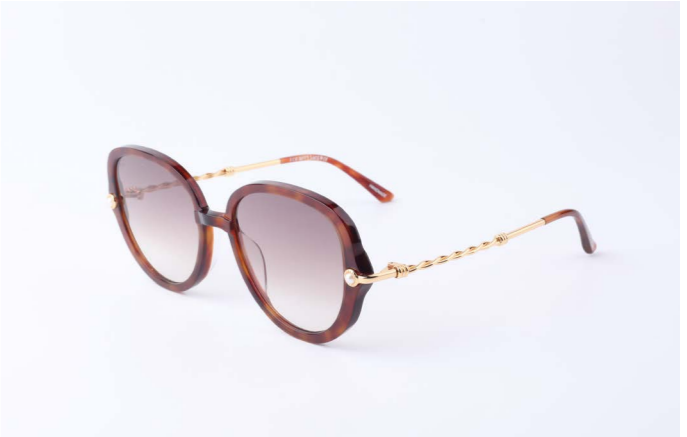
SJ2 Primrose Champagne / Champagne gradient lens